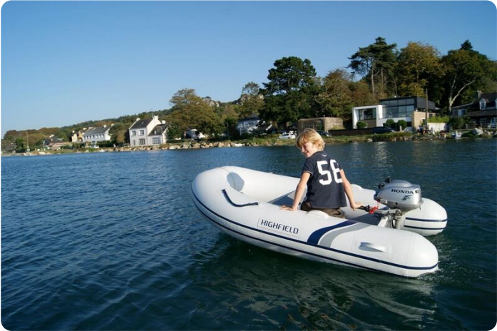
Highfield UL 240 aluminium RIB - on the water