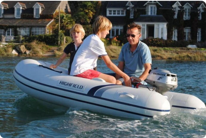
Highfield UL 240 aluminium RIB