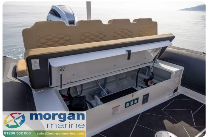
Highfield Sport 800 aluminium RIB - storage under seating