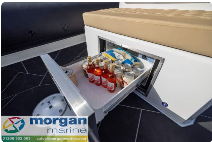
Highfield Sport 800 aluminium RIB - drinks storage