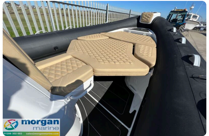
Highfield Sport 700 - bow cushions and forward console seat - with infill