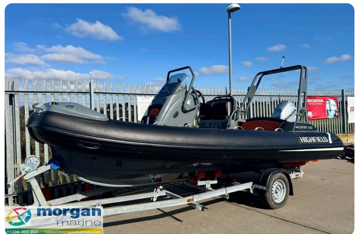
Highfield Sport 560 Hunter - side