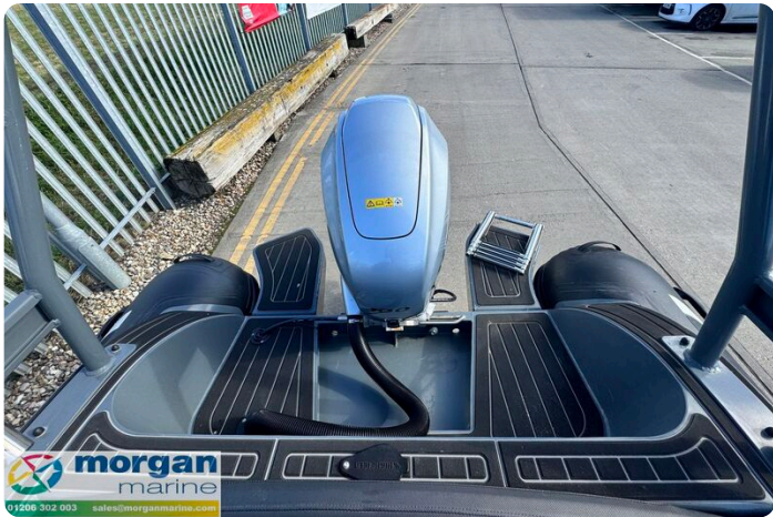
Highfield Sport 560 Hunter - back swim platforms