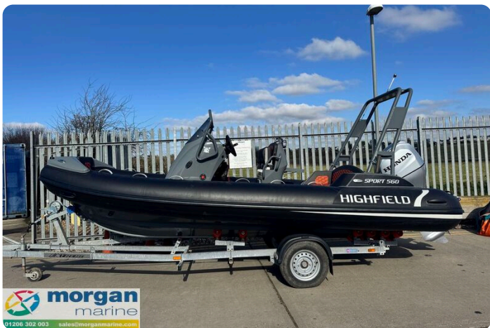
Highfield Sport 560 Hunter - side view