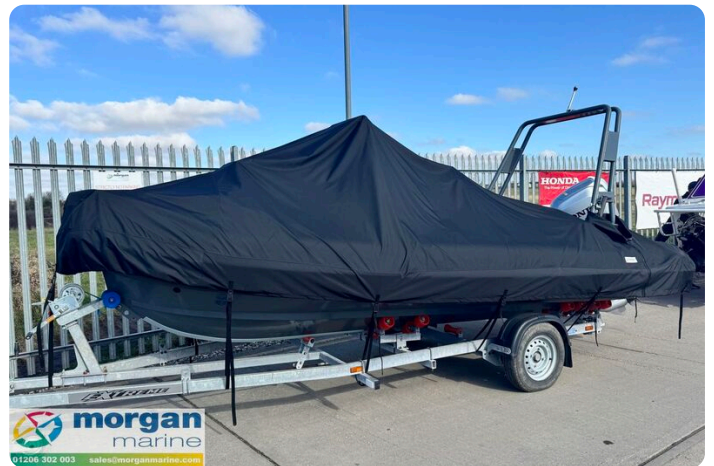
Highfield Sport 560 Hunter - full cover