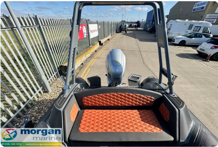
Highfield Sport 560 Hunter - bench seat