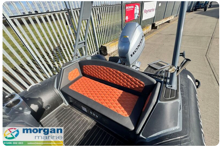
Highfield Sport 560 Hunter - bench seating