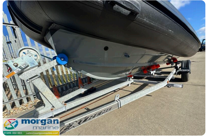
Highfield Sport 560 Hunter - hull