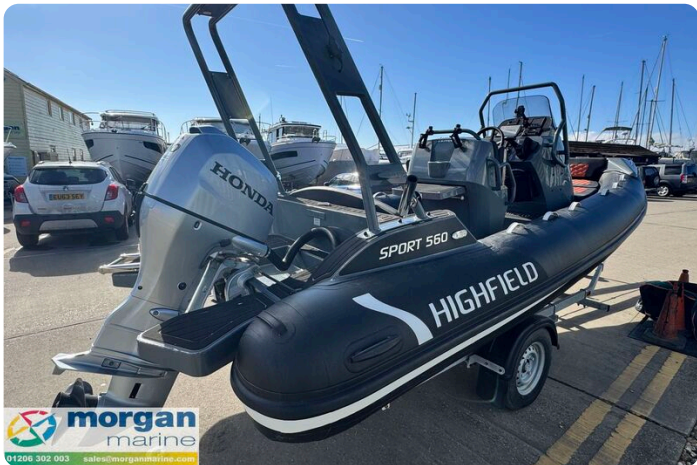
Highfield Sport 560 Hunter - grab - handles