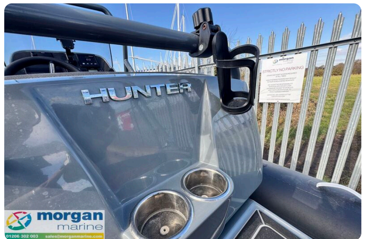
Highfield Sport 560 Hunter - cup holders