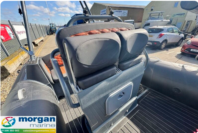
Highfield Sport 560 Hunter - fold up