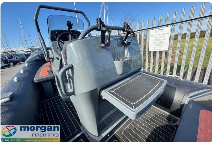
Highfield Sport 560 Hunter - pop up table