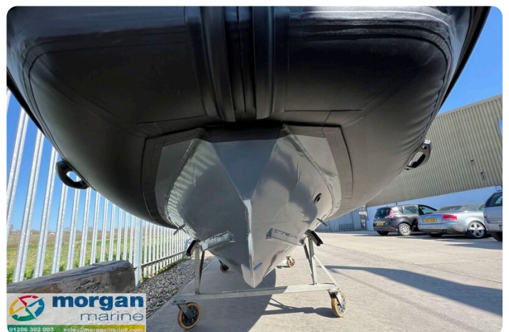
Highfield Sport 520 aluminium RIB - hull