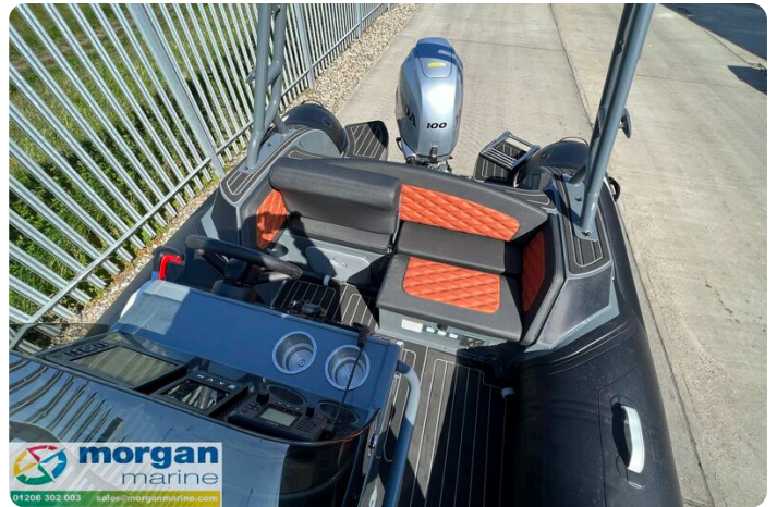
Highfield Sport 520 aluminium RIB - overhead view towards engine