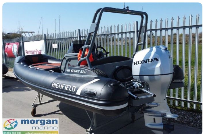
Highfield Sport 520 aluminium RIB - A-frame