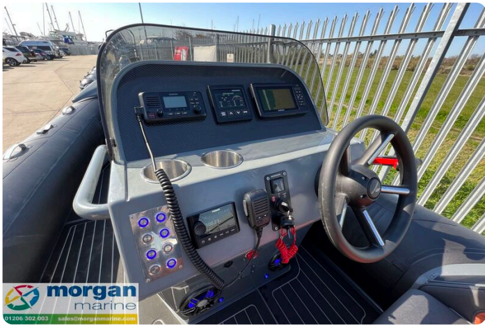
Highfield Sport 520 aluminium RIB - dash and engine controls