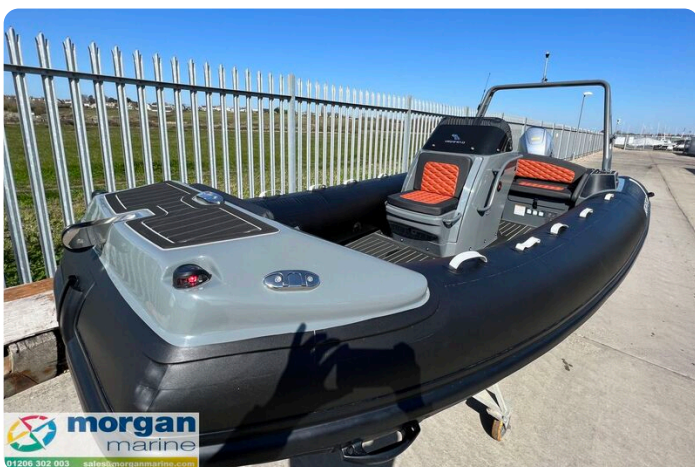
Highfield Sport 520 aluminium RIB - bow locker