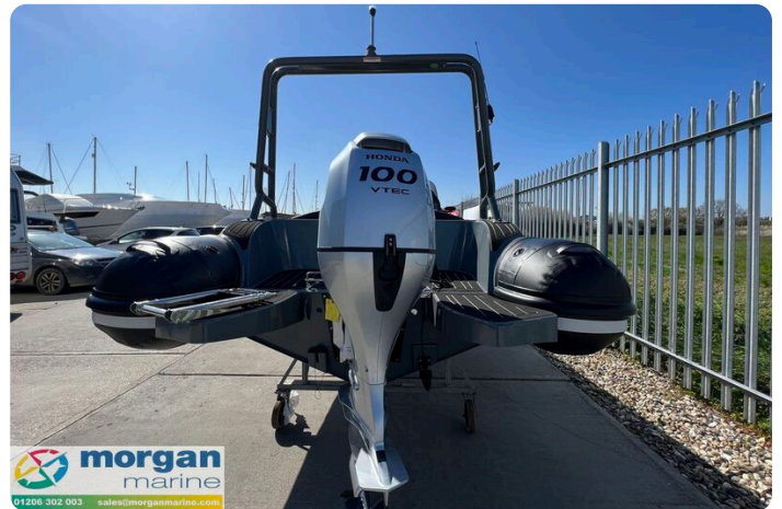
Highfield Sport 520 aluminium RIB - transom and engine