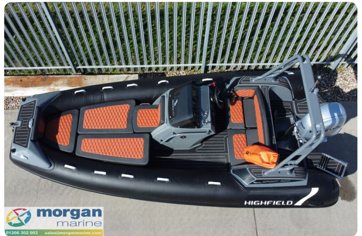
Highfield Sport 520 aluminium RIB - overhead view with cushions