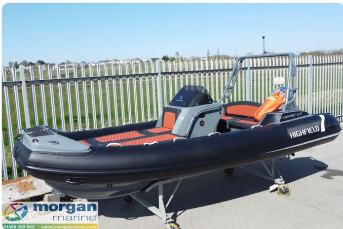
Highfield Sport 520 aluminium RIB - port side view with cushions