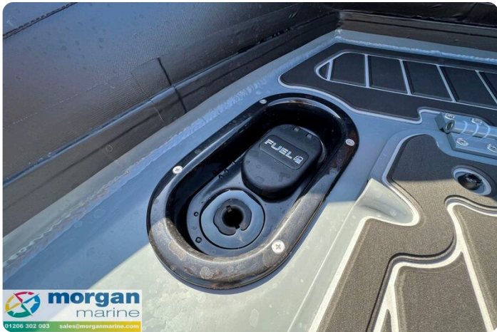
Highfield Sport 520 aluminium RIB - fuel fill