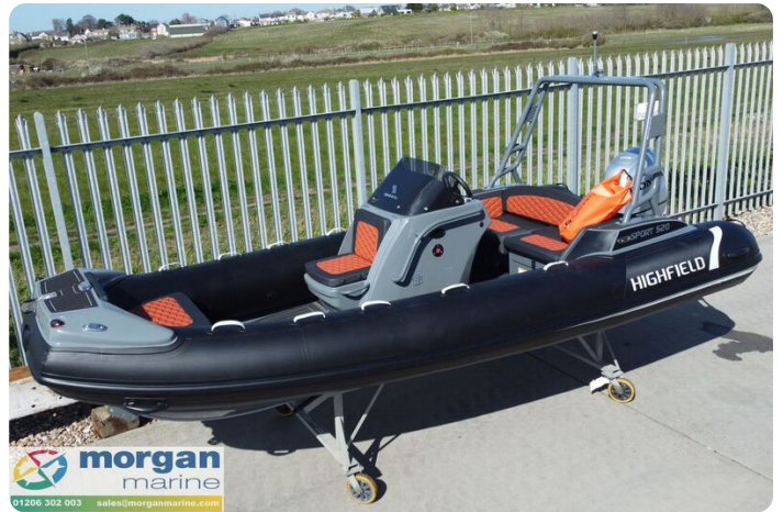
Highfield Sport 520 aluminium RIB - view from port side bow