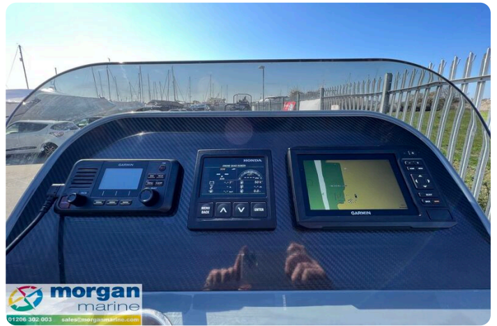
Highfield Sport 520 aluminium RIB - navigation electronics