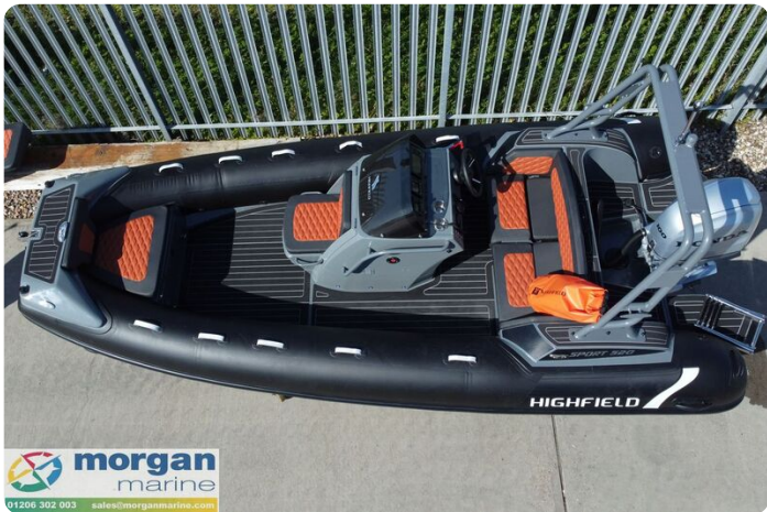
Highfield Sport 520 aluminium RIB - overhead view with forward console seat