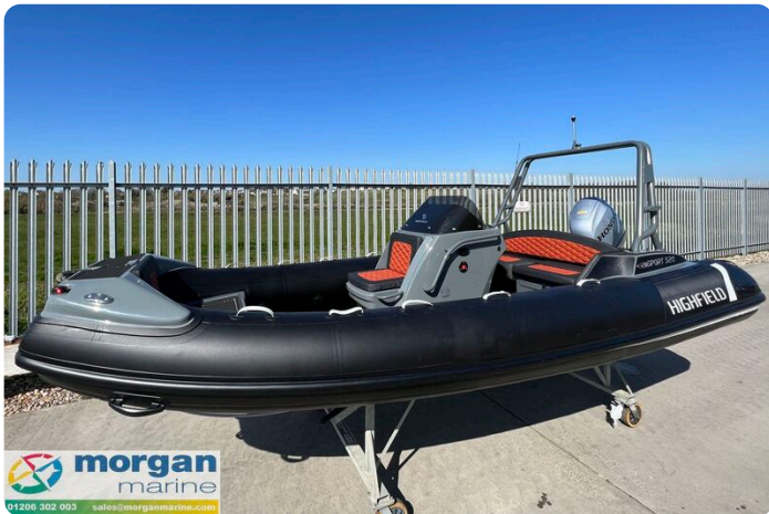
Highfield Sport 520 aluminium RIB