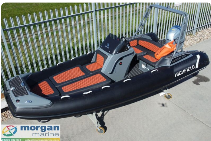
Highfield Sport 520 aluminium RIB - port side overhead view with cushions in bow