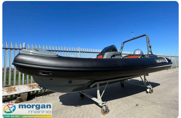
Highfield Sport 520 aluminium RIB - port side tubes