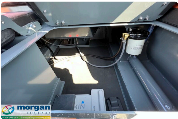
Highfield Sport 520 aluminium RIB - storage