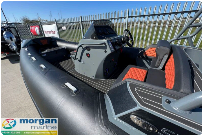
Highfield Sport 520 aluminium RIB - view towards console