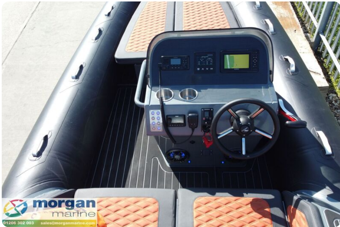
Highfield Sport 520 aluminium RIB - console and dash