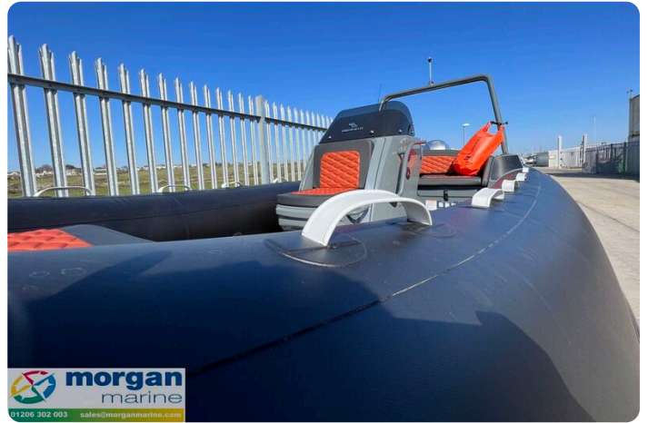
Highfield Sport 520 aluminium RIB - grab handles