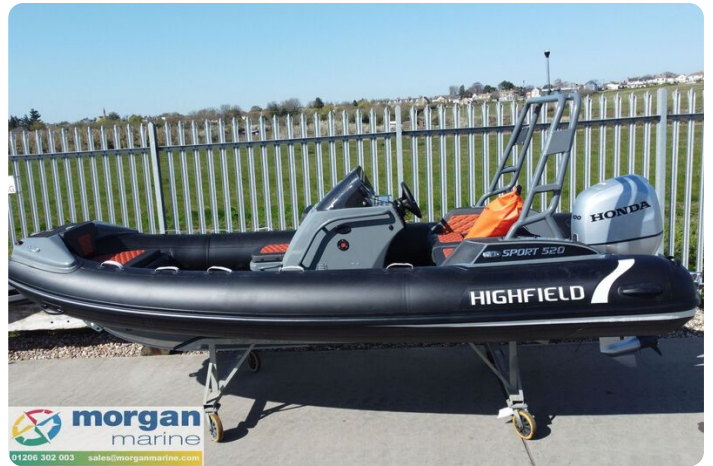
Highfield Sport 520 aluminium RIB - port side view