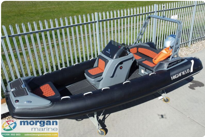
Highfield Sport 520 aluminium RIB - overhead view