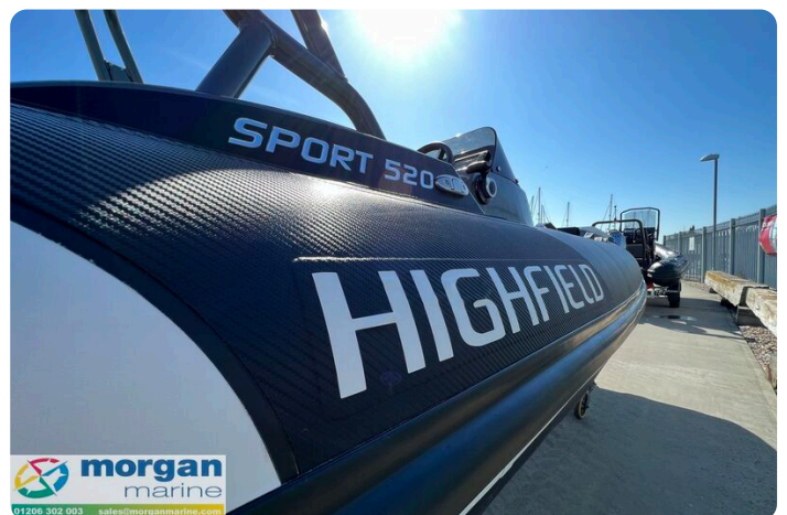
Highfield Sport 520 aluminium RIB - decals