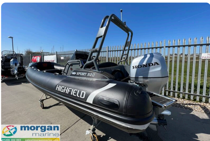
Highfield Sport 520 aluminium RIB - view from port side aft