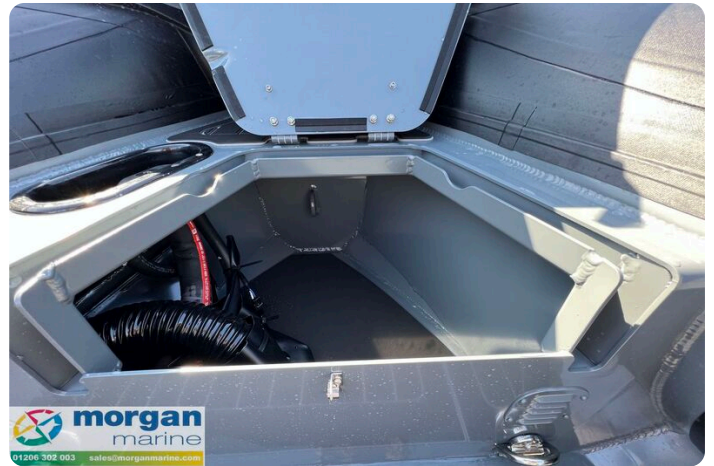
Highfield Sport 520 aluminium RIB - storage locker