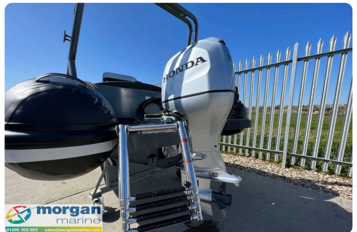
Highfield Sport 520 aluminium RIB - Honda BF100 outboard engine