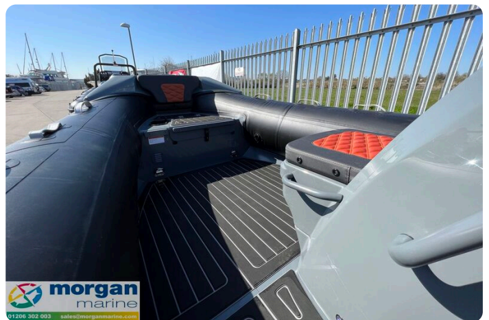
Highfield Sport 520 aluminium RIB - view towards bow from console