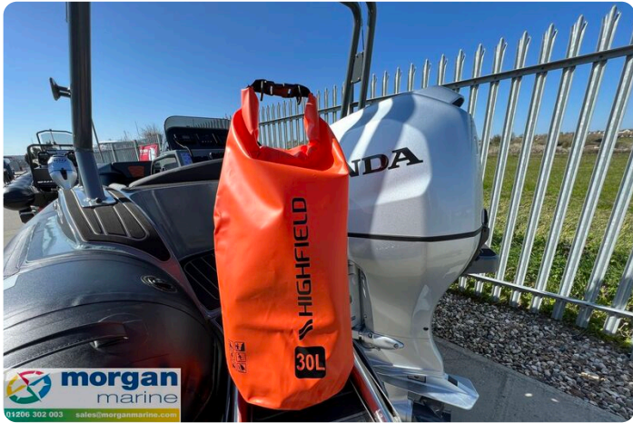
Highfield Sport 520 aluminium RIB - Highfield dry-bag on transom