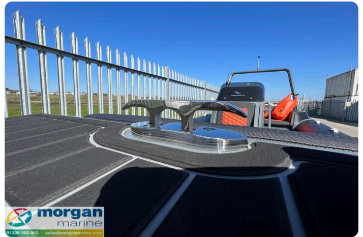
Highfield Sport 520 aluminium RIB - cleat