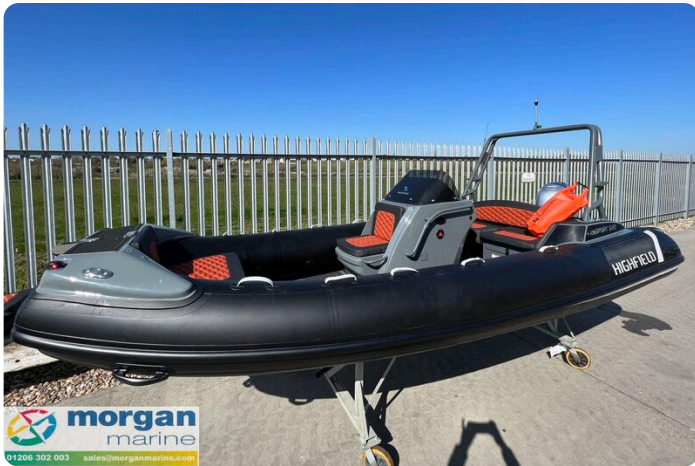
Highfield Sport 520 aluminium RIB - port side