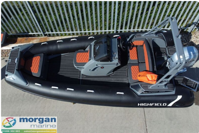
Highfield Sport 520 aluminium RIB - overhead view with forward console seat