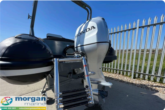
Highfield Sport 520 aluminium RIB - Honda BF100 outboard engine