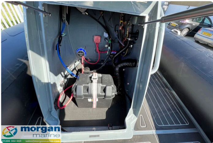
Highfield Sport 520 aluminium RIB - storage in console