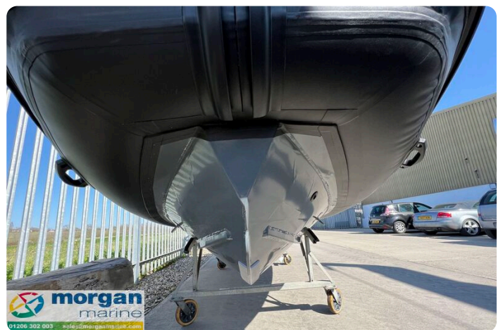
Highfield Sport 520 aluminium RIB - hull