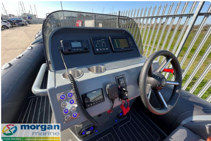
Highfield Sport 520 aluminium RIB - dash and engine controls