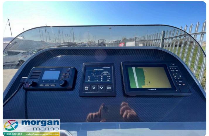
Highfield Sport 520 aluminium RIB - navigation electronics