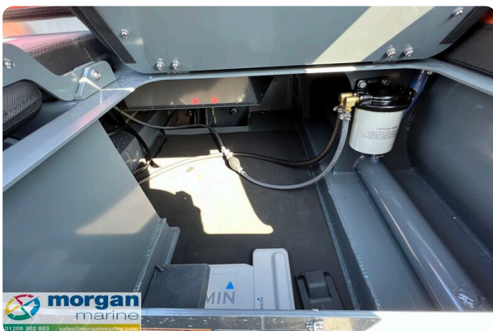
Highfield Sport 520 aluminium RIB - storage