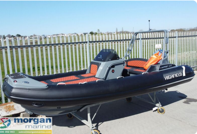
Highfield Sport 520 aluminium RIB - port side view with cushions