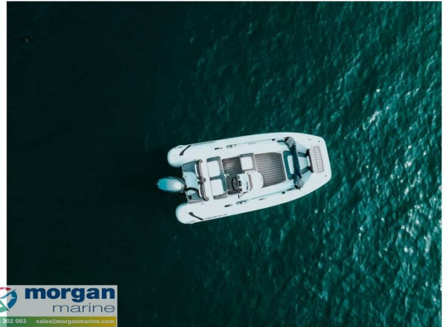
Highfield Sport 360 aluminium RIB