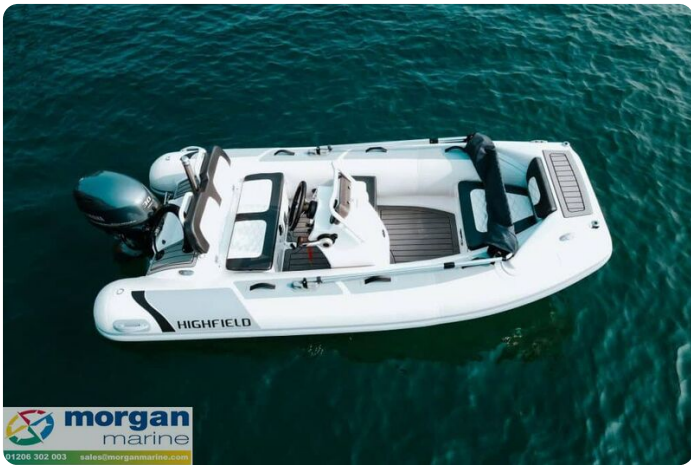
Highfield Sport 360 aluminium RIB