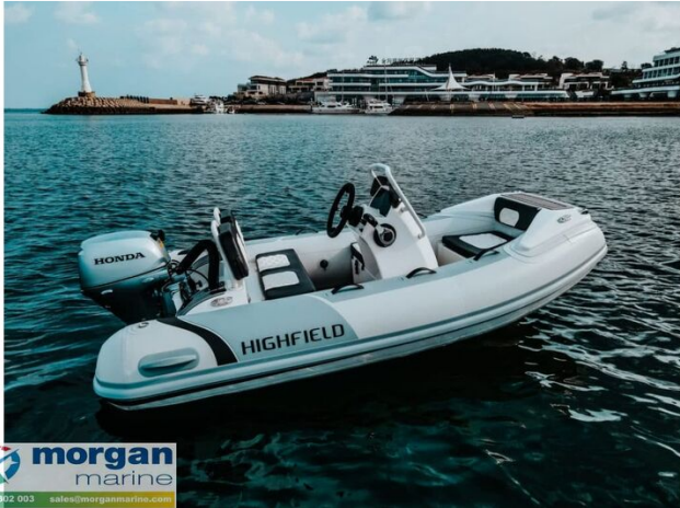
Highfield Sport 300 aluminium RIB