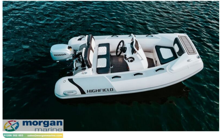
Highfield Sport 300 aluminium RIB - overhead view from starboard side