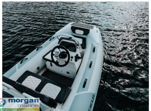
Highfield Sport 300 aluminium RIB - overhead view from aft