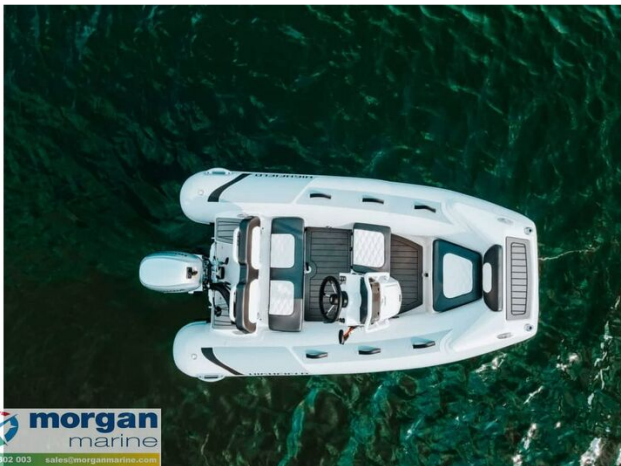
Highfield Sport 300 aluminium RIB - overhead view