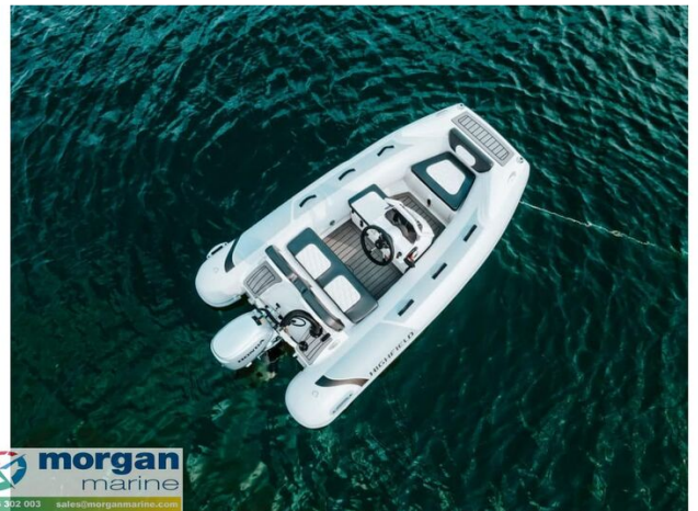
Highfield Sport 300 aluminium RIB - on the water