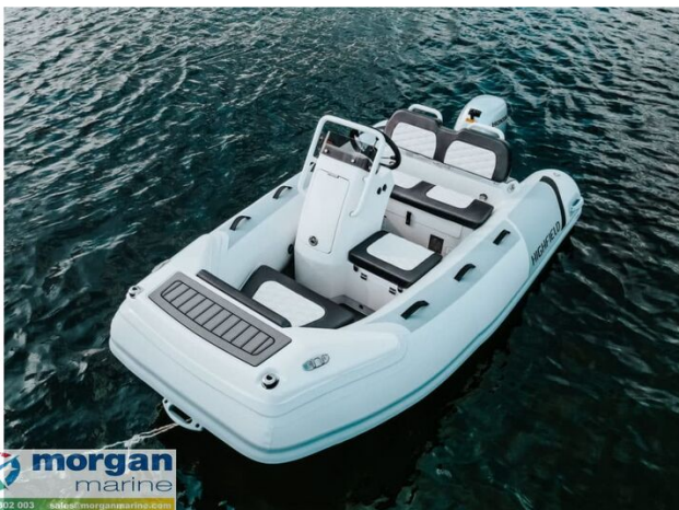
Highfield Sport 300 aluminium RIB - overhead view from bow