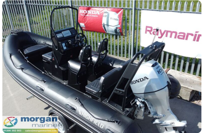
Highfield Patrol 500 aluminium RIB - overhead view of console