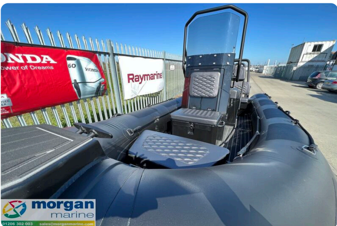
Highfield Patrol 500 aluminium RIB - tubes and bow seating