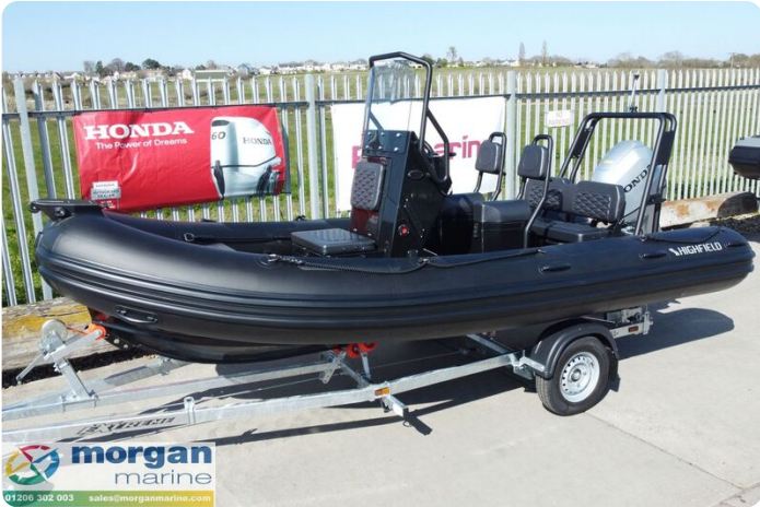
Highfield Patrol 500 aluminium RIB