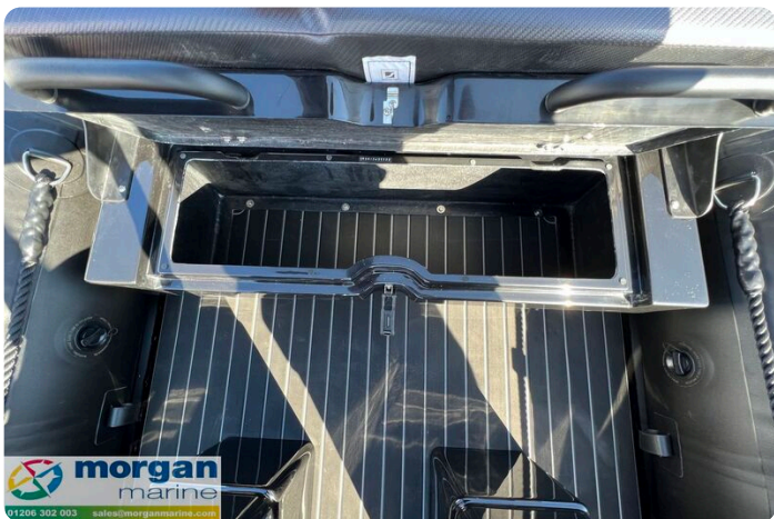
Highfield Patrol 500 aluminium RIB - deck and locker