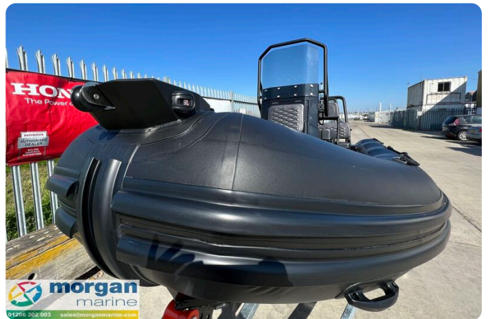
Highfield Patrol 500 aluminium RIB - bow and tubes