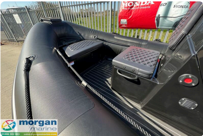
Highfield Patrol 500 aluminium RIB - bow seating