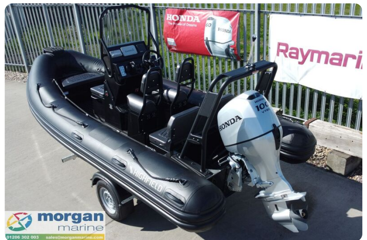
Highfield Patrol 500 aluminium RIB - aft port side with Honda outboard