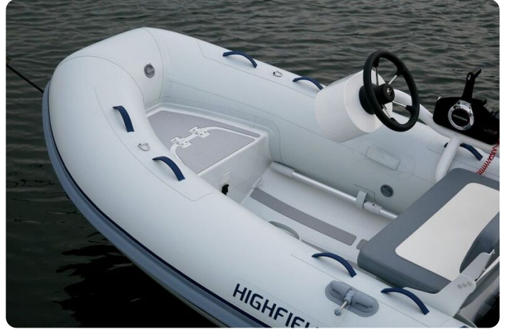
Highfield CL 340 aluminium RIB - bow