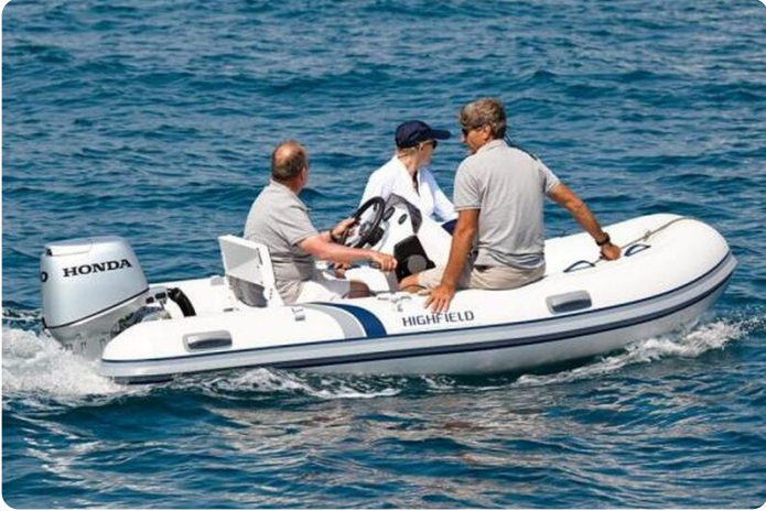
Highfield CL 260 aluminium RIB