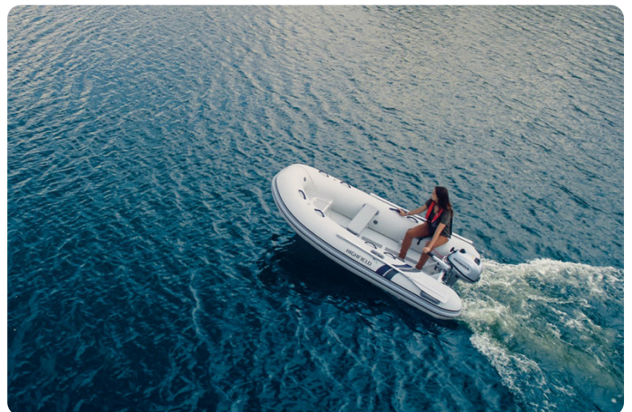
Highfield CL340 aluminium RIB - birdseye view