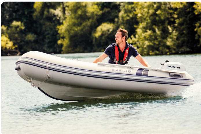
Highfield CL340 aluminium RIB