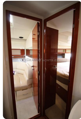
Fairline Targa 38