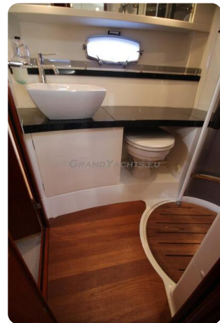
Fairline Targa 38