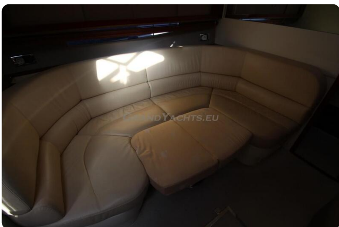
Fairline Targa 38