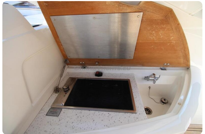
Fairline Targa 38