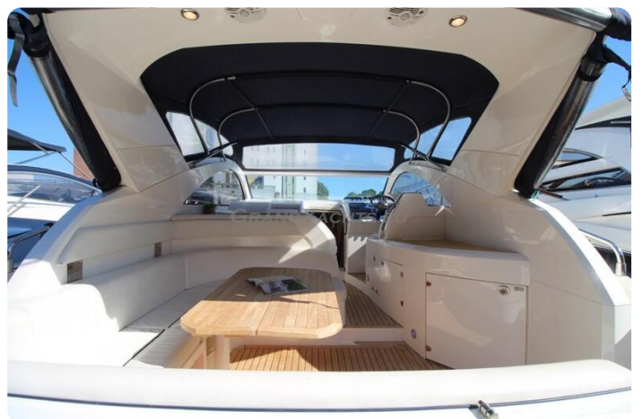
Fairline Targa 38