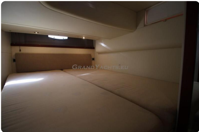
Fairline Targa 38