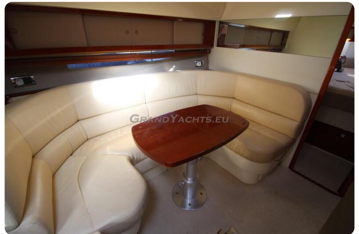
Fairline Targa 38