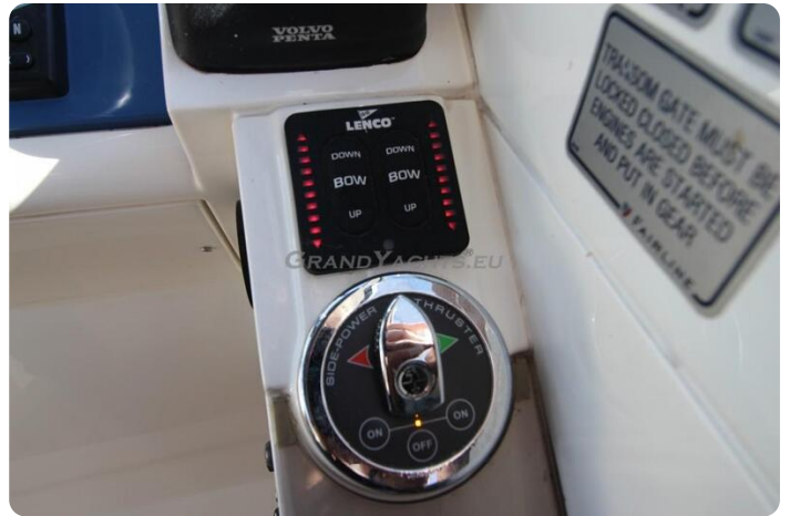
Fairline Targa 38