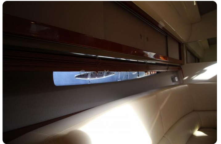
Fairline Targa 38