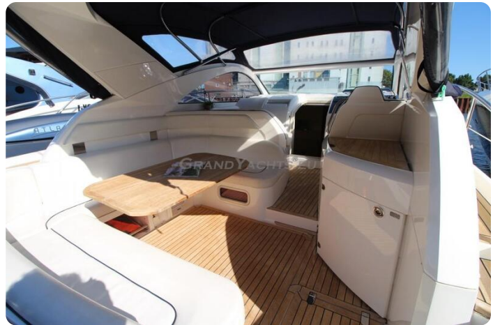
Fairline Targa 38