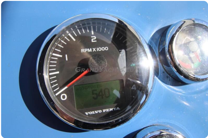
Fairline Targa 38