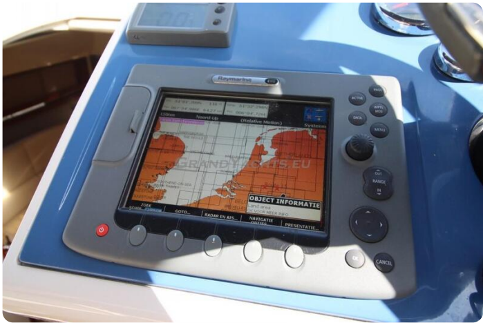
Fairline Targa 38