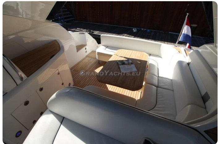
Fairline Targa 38