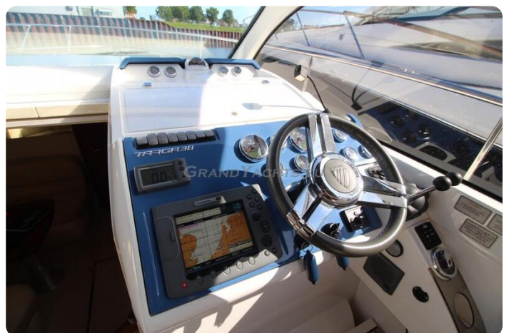
Fairline Targa 38