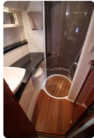
Fairline Targa 38