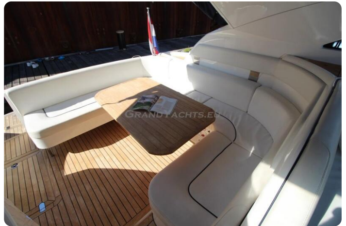
Fairline Targa 38