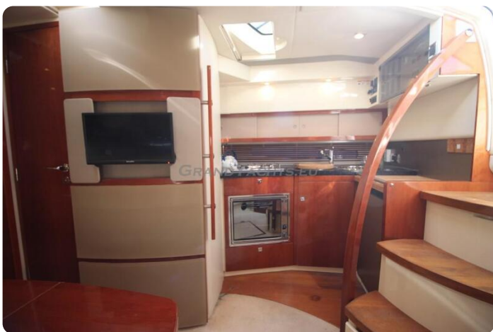
Fairline Targa 38