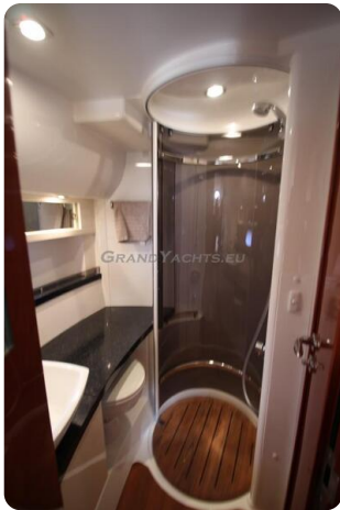
Fairline Targa 38