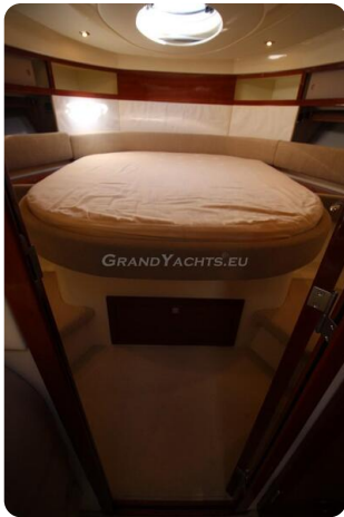
Fairline Targa 38