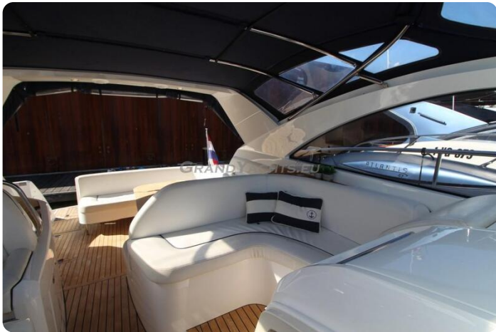
Fairline Targa 38