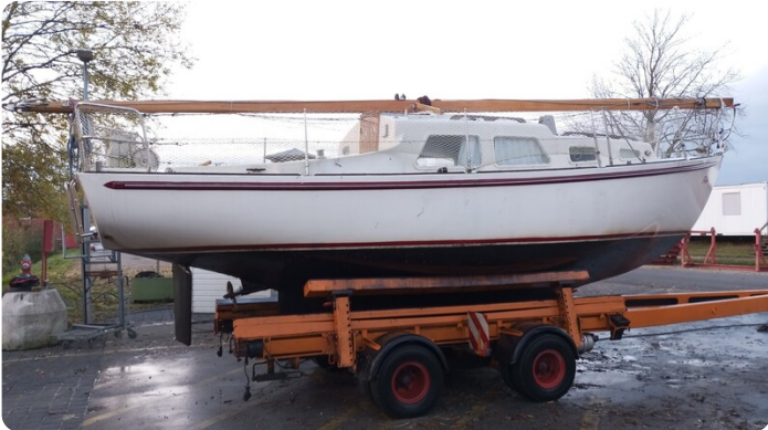
Foto auf Trailer