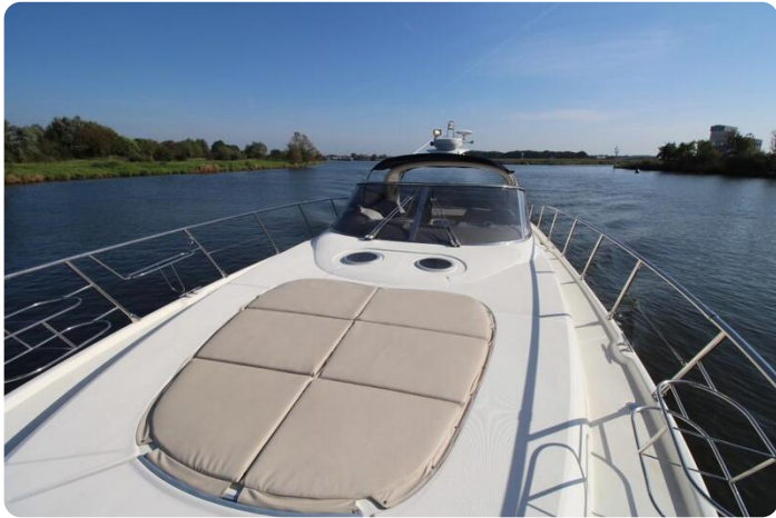
Cranchi Méditerranée 50