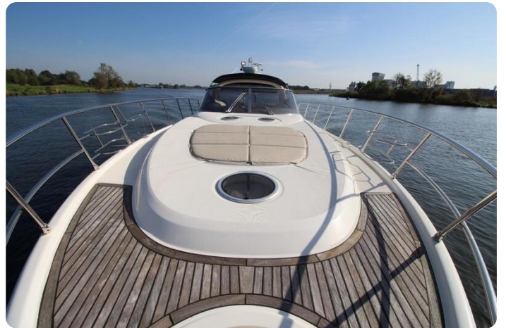
Cranchi Méditerranée 50