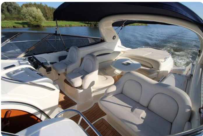
Cranchi Méditerranée 50