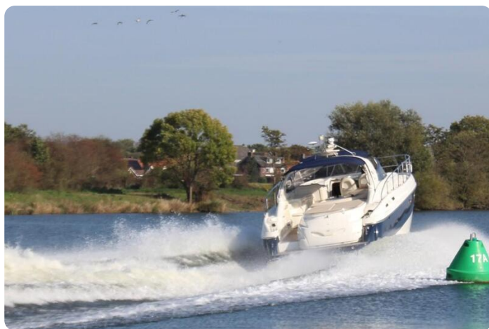
Cranchi Mediterrannée 50