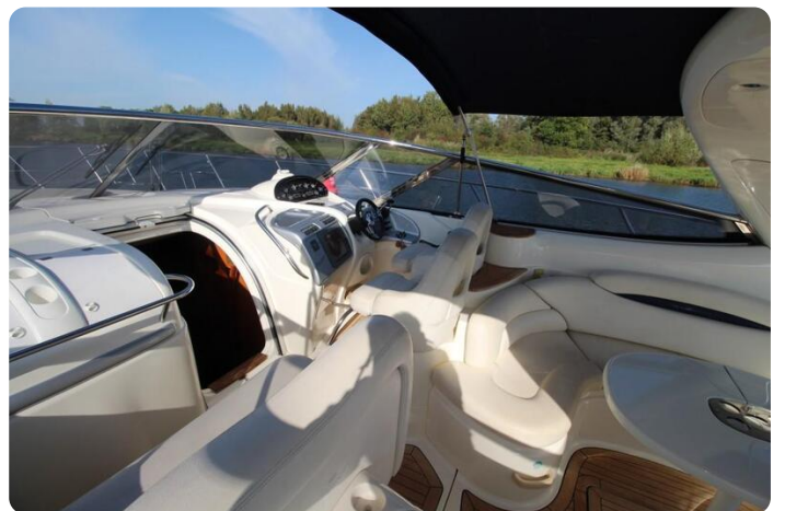
Cranchi Méditerranée 50