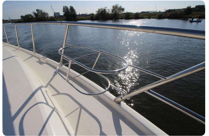
Cranchi Méditerranée 50