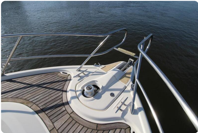
Cranchi Méditerranée 50