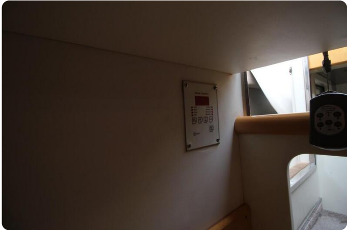
Cranchi 41 Mediterranee