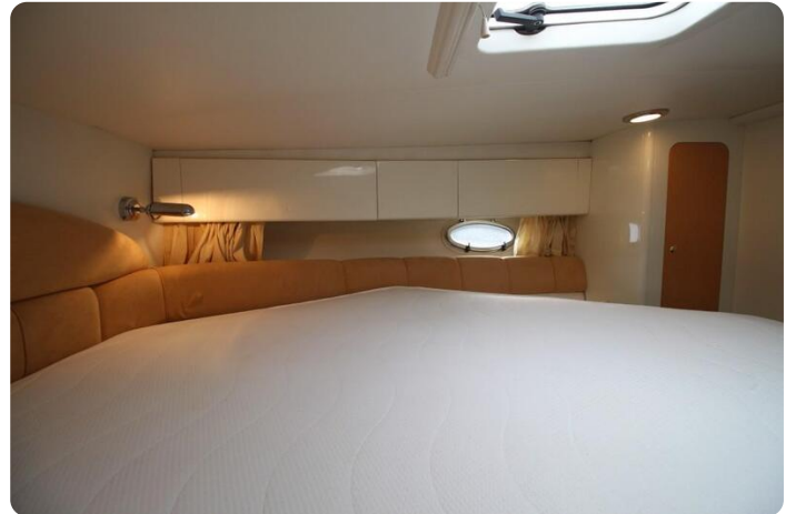
Cranchi 41 Mediterranee