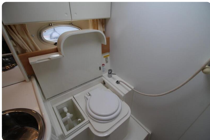
Cranchi 41 Mediterranean