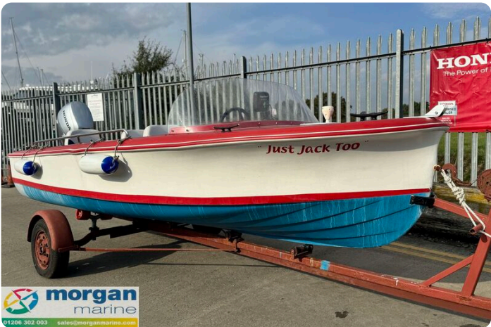
Classic mid-1970s river launch-side