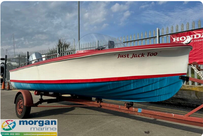
Classic mid-1970s river launch-main