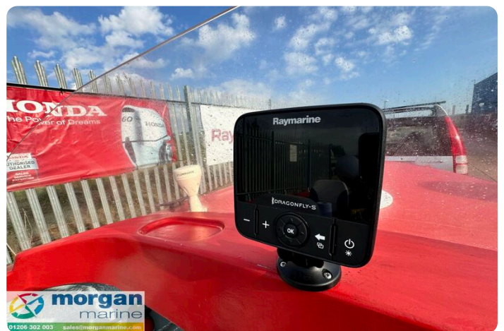
Classic mid-1970s river launch-plotter