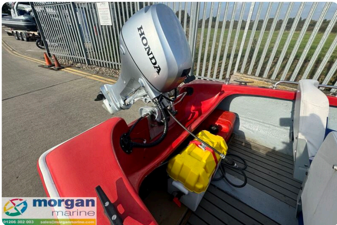
Classic mid-1970s river launch-fuel