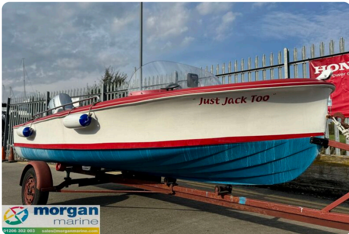
Classic mid-1970s river launch-fenders