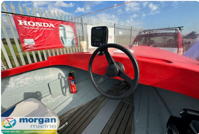
Classic mid-1970s river launch-wheel