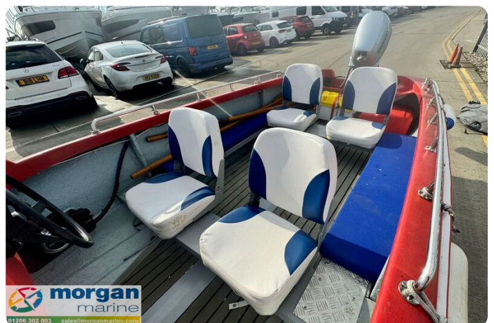
Classic mid-1970s river launch-seating