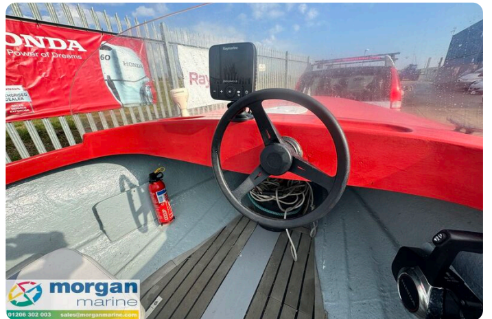
Classic mid-1970s river launch-wheel