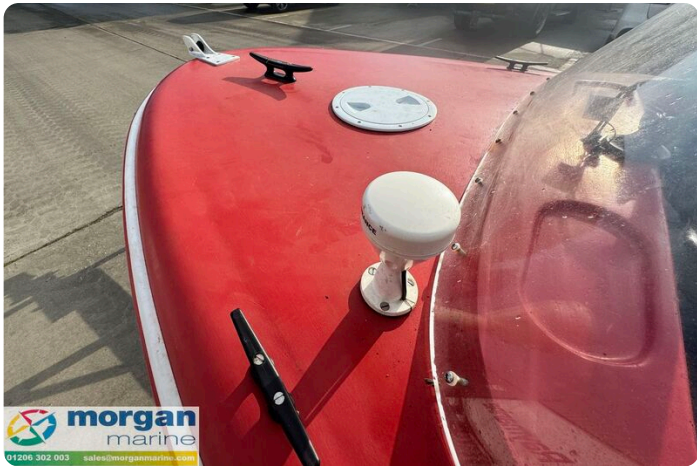
Classic mid-1970s river launch-mooring-cleat