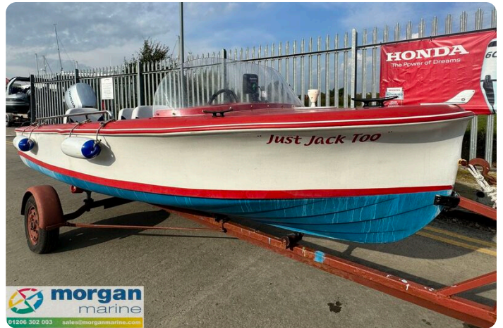
Classic mid-1970s river launch-side