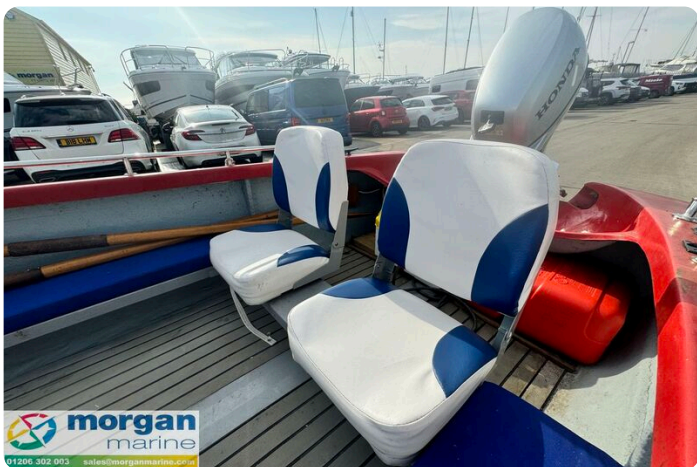
Classic mid-1970s river launch-back-seat