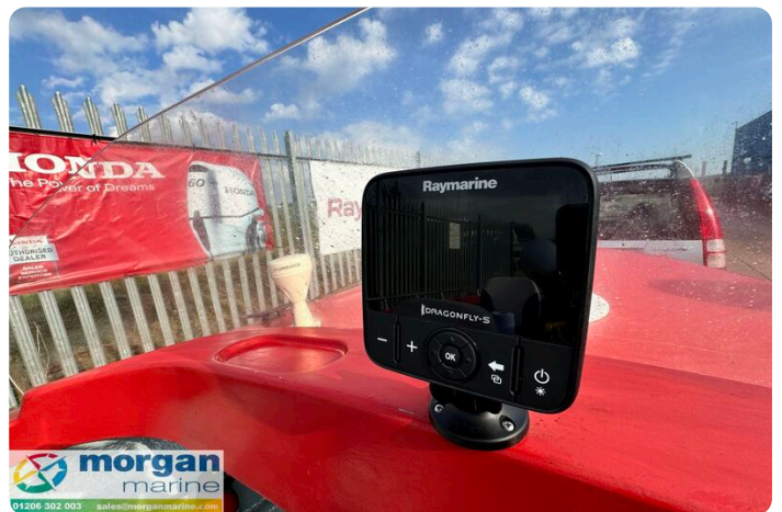
Classic mid-1970s river launch-plotter