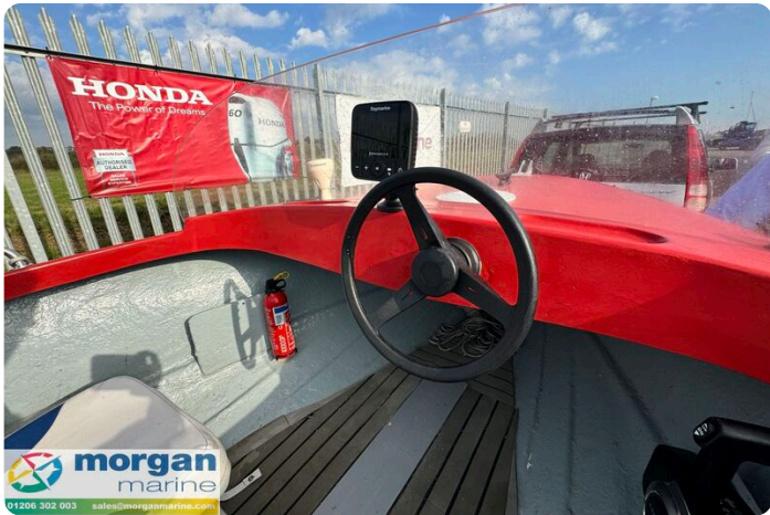
Classic mid-1970s river launch-wheel