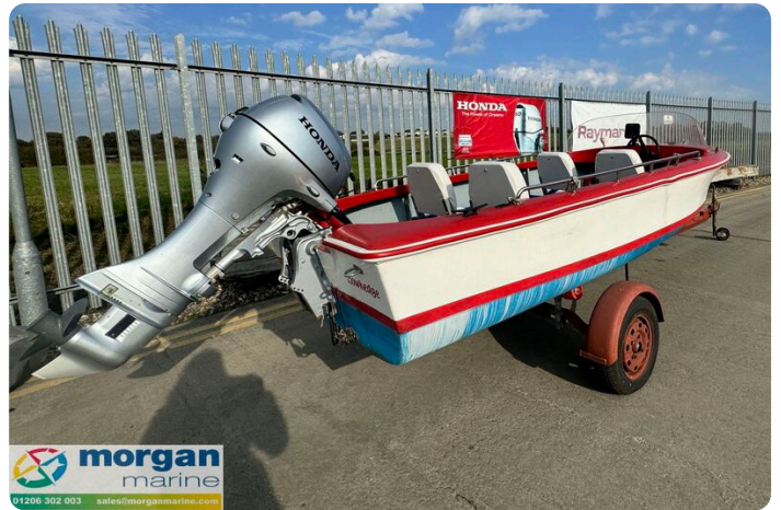
Classic mid-1970s river launch-engine