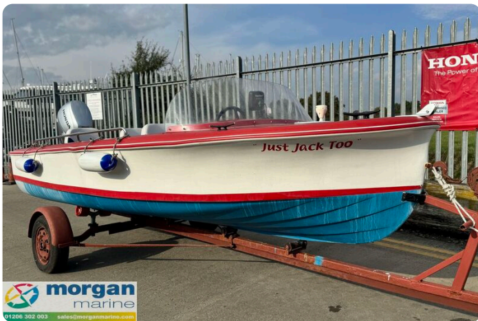
Classic mid-1970s river launch-side