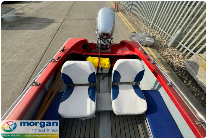
Classic mid-1970s river launch-seat