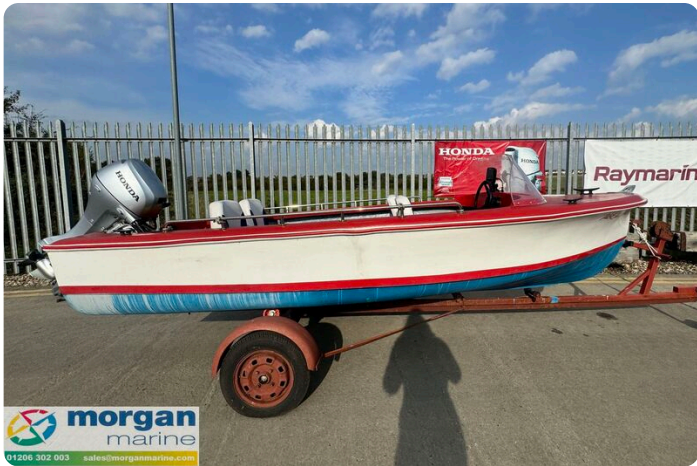
Classic mid-1970s river launch-side-view