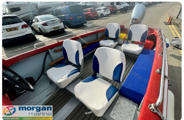
Classic mid-1970s river launch-seating