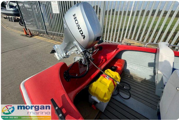
Classic mid-1970s river launch-fuel