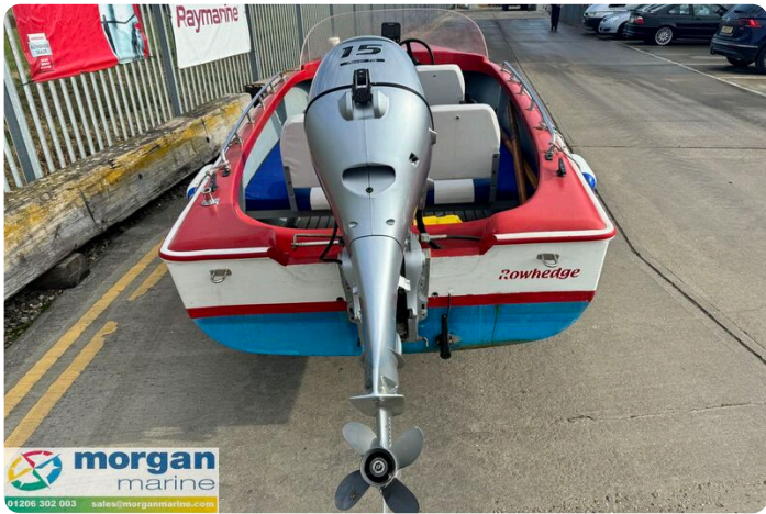
Classic mid-1970s river launch-prop