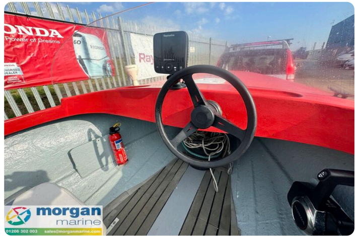
Classic mid-1970s river launch-wheel