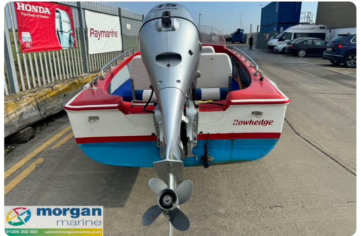
Classic mid-1970s river launch-back-engine