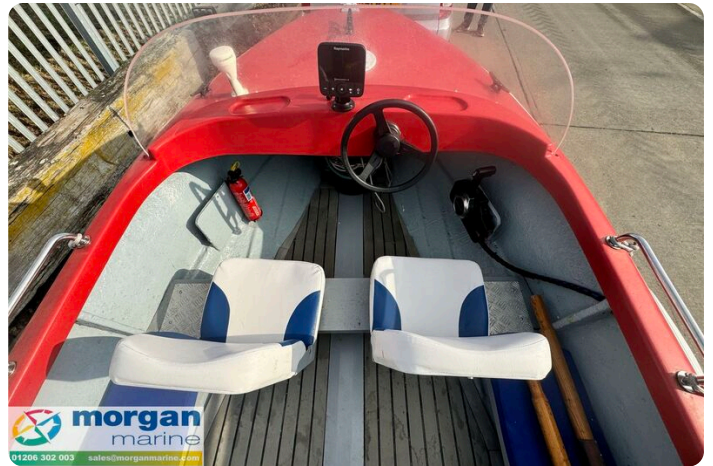
Classic mid-1970s river launch-pilot-seat