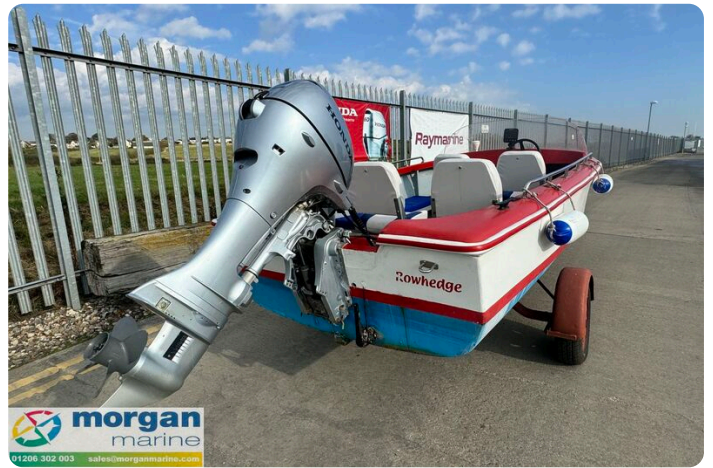
Classic mid-1970s river launch-back-of-engine