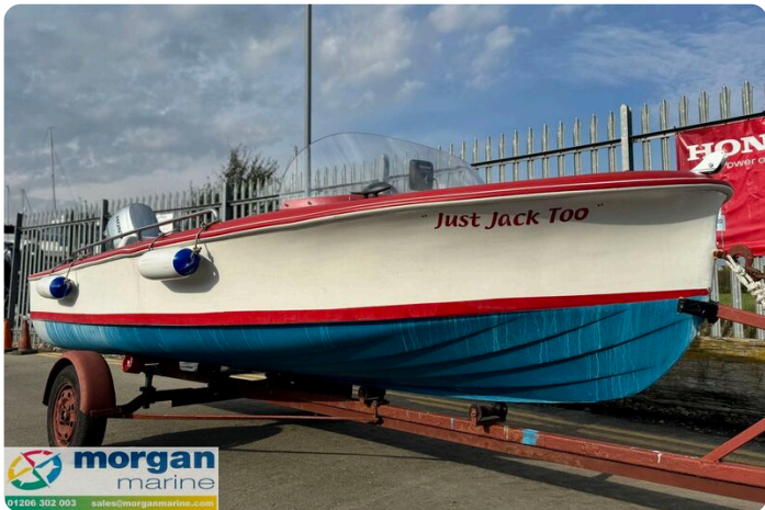
Classic mid-1970s river launch-fenders