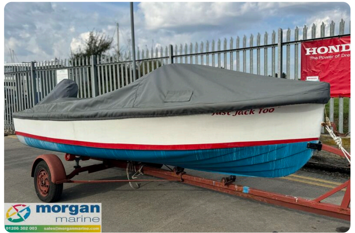
Classic mid-1970s river launch-cover