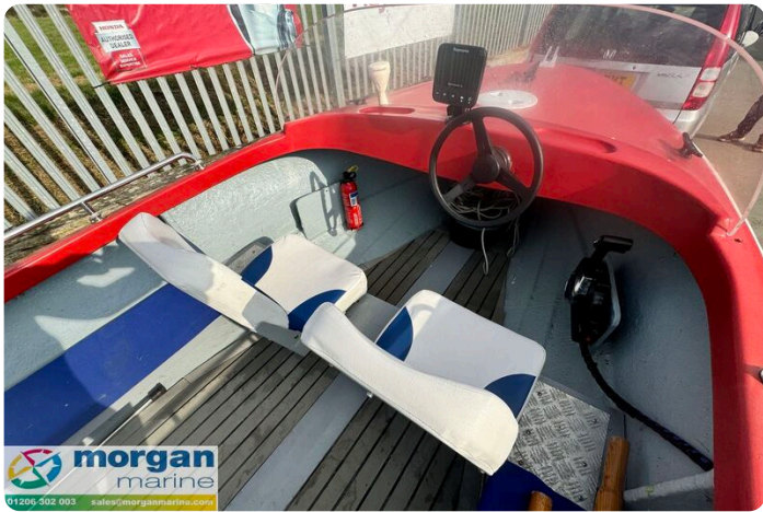
Classic mid-1970s river launch-engine-dash