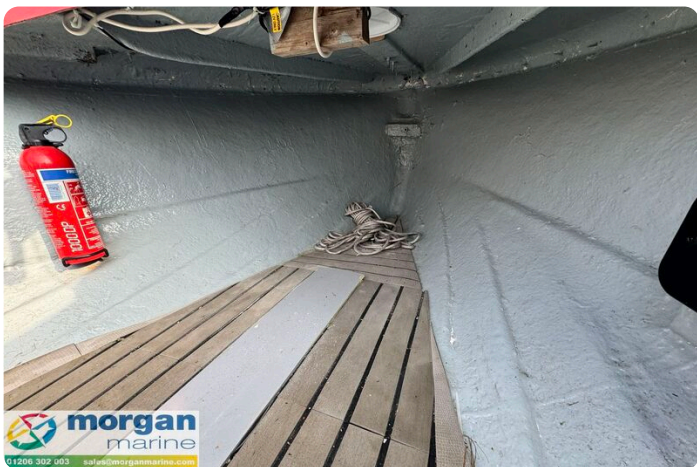
Classic mid-1970s river launch-storage