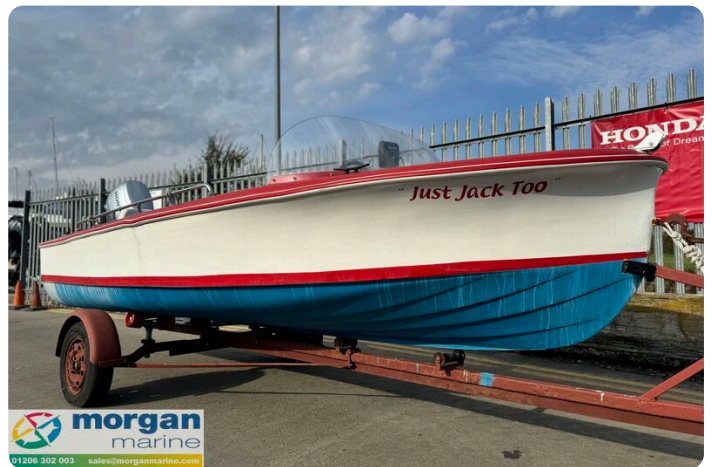
Classic mid-1970s river launch-main