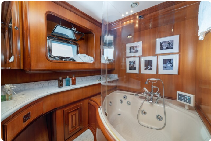
Aquarius IV Master Head