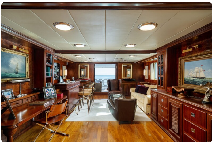
Aquarius IV Living Aft View