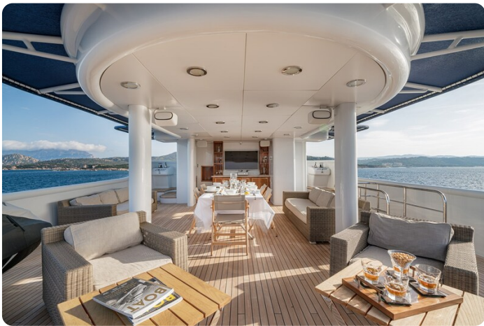
Aquarius IV Main Deck Dinette