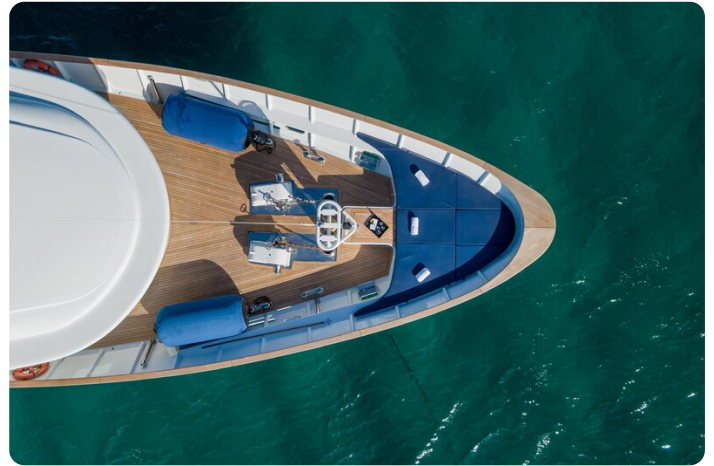
Aquarius IV Aerial View Bow