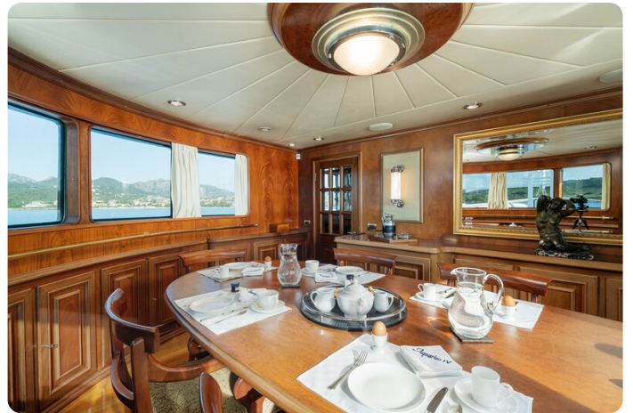
Aquarius IV Dinette