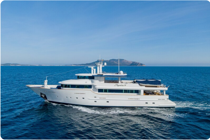
Aquarius IV Port Profile