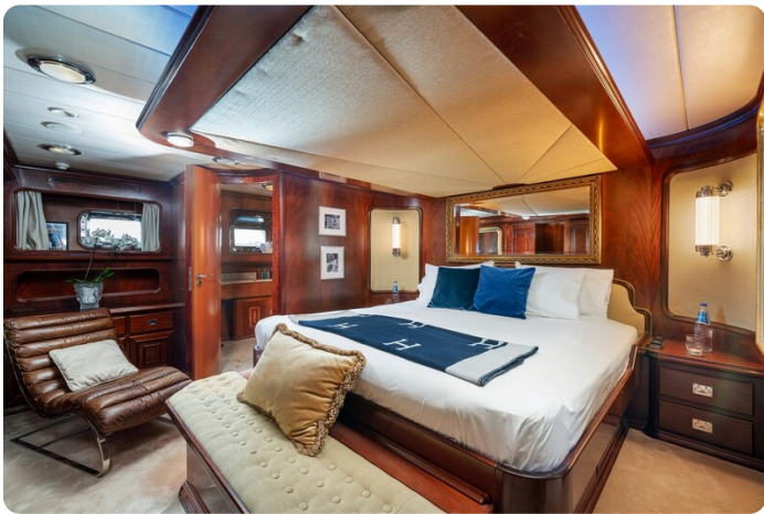
Aquarius IV Master Cabin