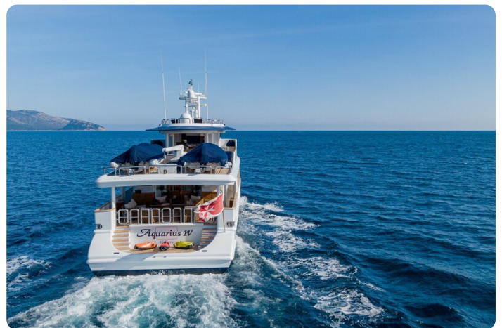
Aquarius IV Stern View Cruising