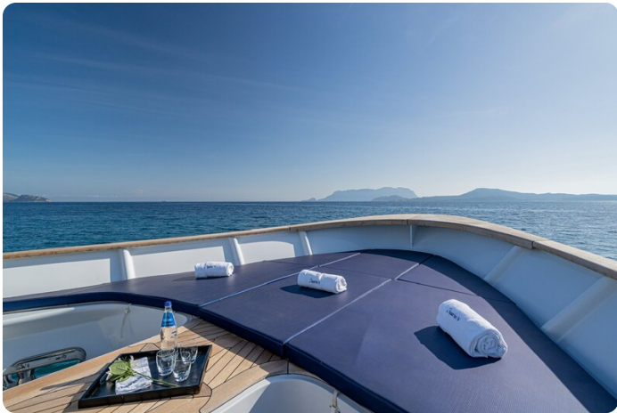
Aquarius IV Bow Sunpad