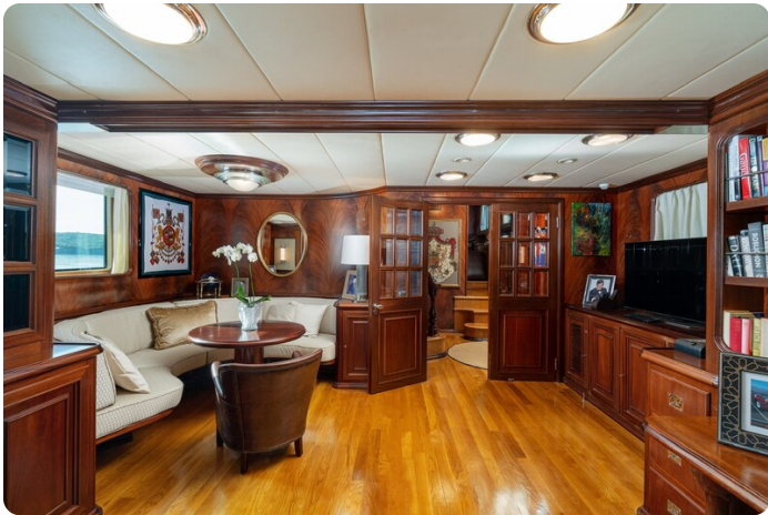
Aquarius IV Living Detail