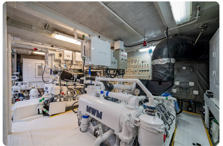
Aquarius IV Engine Room