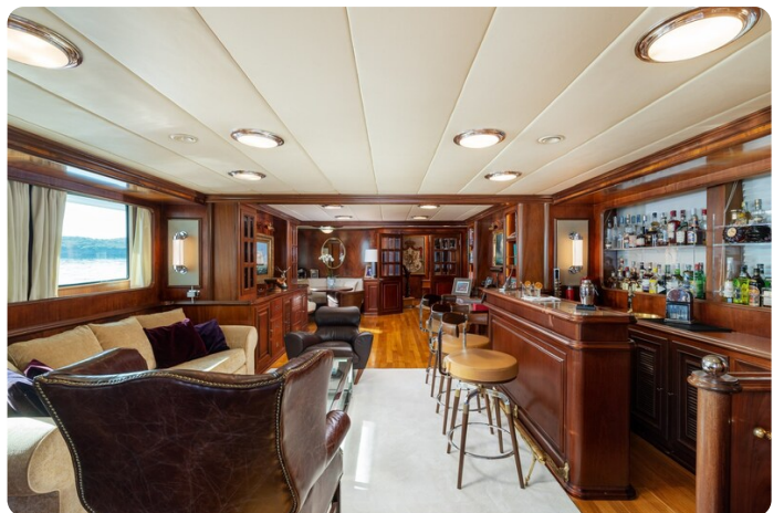
Aquarius IV Living Fwd View