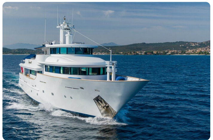
Aquarius IV Fwd Profile