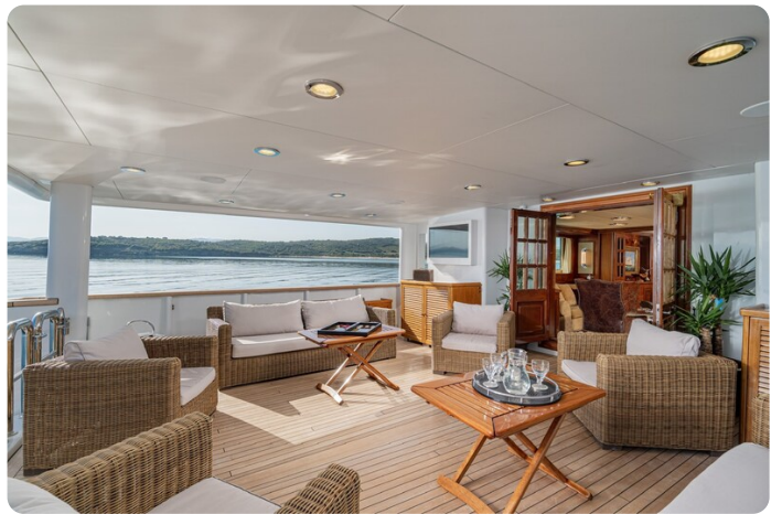
Aquarius IV Stern Dinette