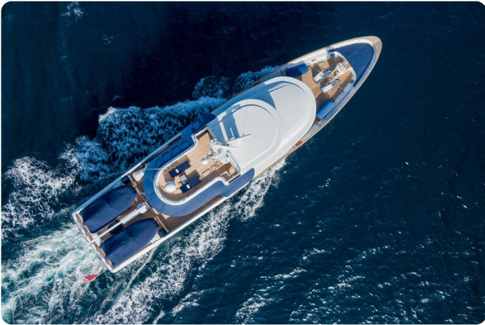
Aquarius IV Aerial Top View Cruising