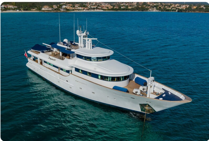
Aquarius IV Fwd Aerial Profile