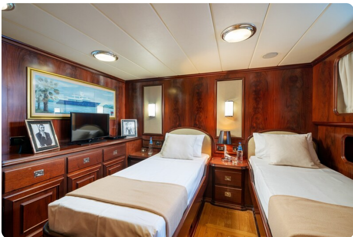
Aquarius IV 1st Twin Guests Cabin