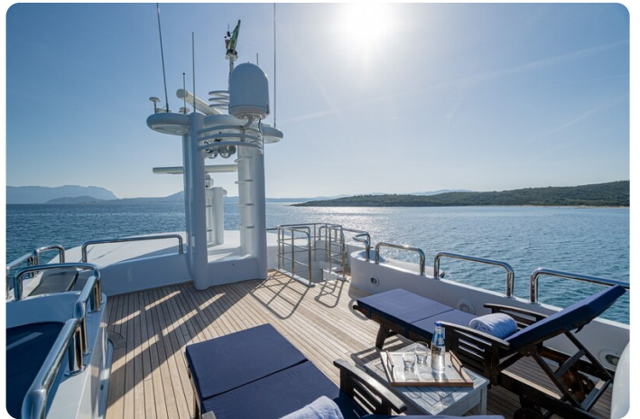
Aquarius IV Fly