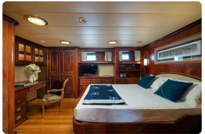
Aquarius IV VIP Stateroom