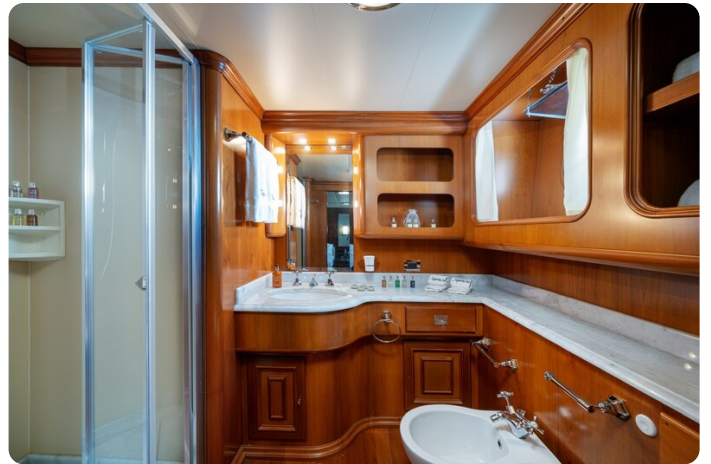
Aquarius IV Guests Head