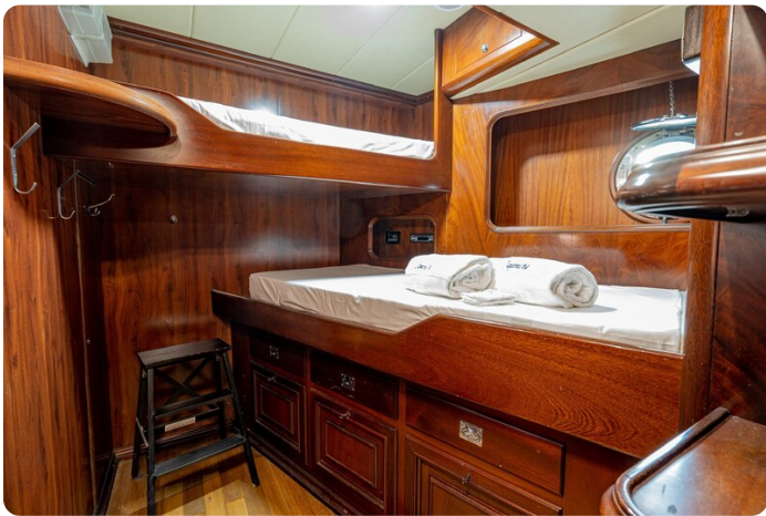
Aquarius IV Twin Crew Cabin