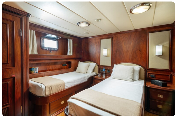
Aquarius IV 2nd Twin Guests Cabin