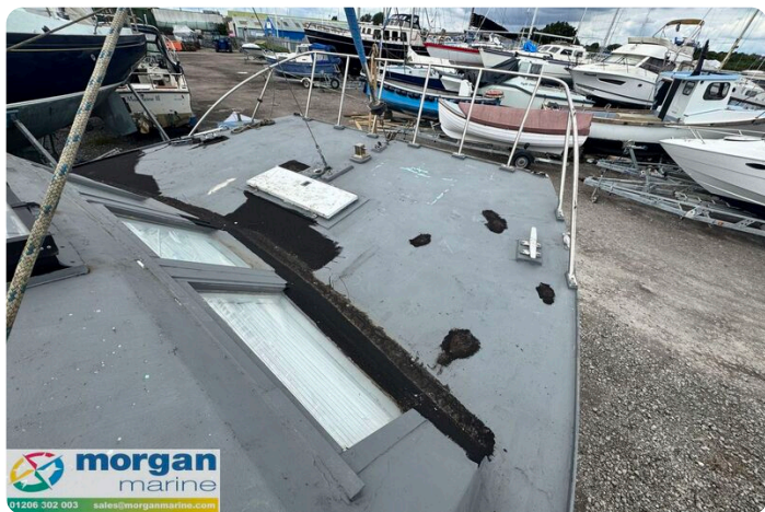
Bill O'Brien Amazon MK1 Catamaran - deck