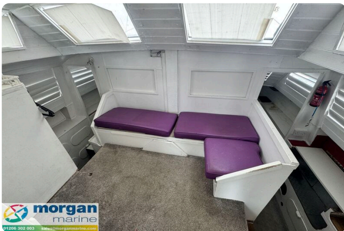
Bill O'brien Amazon MK1 Catamaran - saloon seating