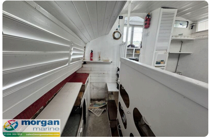
Bill O'Brien Amazon MK1 Catamaran - storage 1