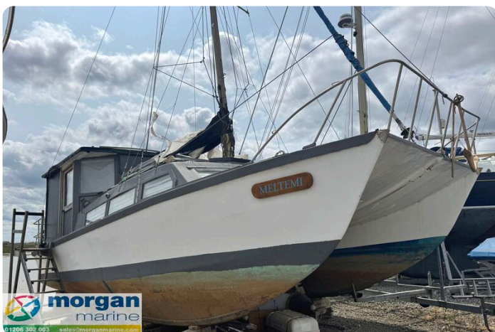
Bill O'Brien Amazon MK1 Catamaran - side