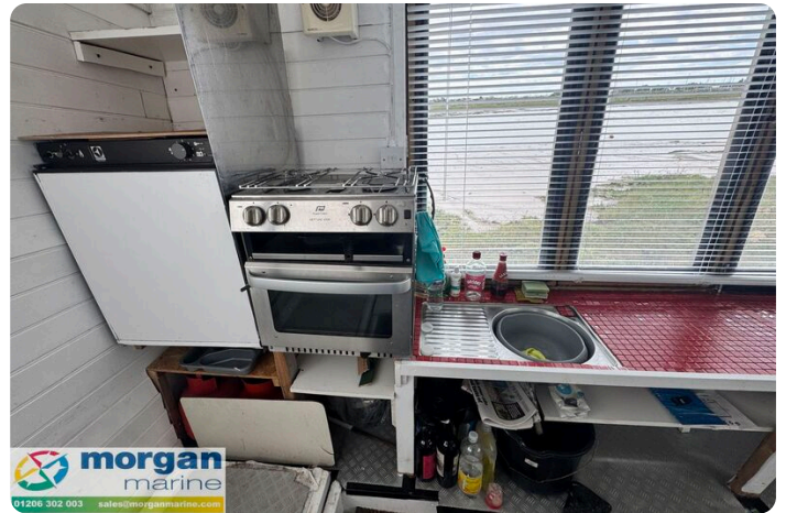
Bill O'Brien Amazon MK1 Catamaran - galley