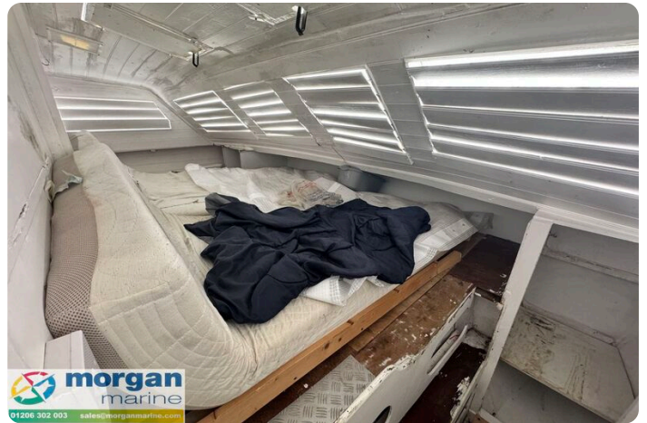
Bill O'Brien Amazon MK1 Catamaran - main berth 2