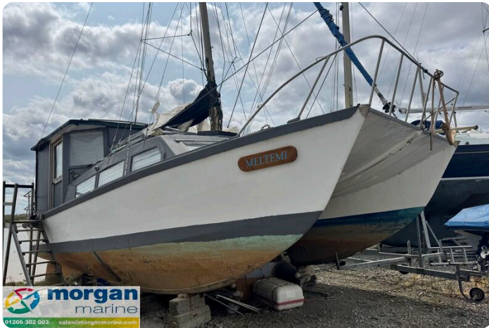
Bill O'Brien Amazon MK1 Catamaran - bow view