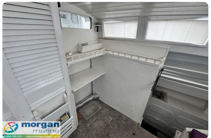
Bill O'brien Amazon MK1 Catamaran - saloon storage