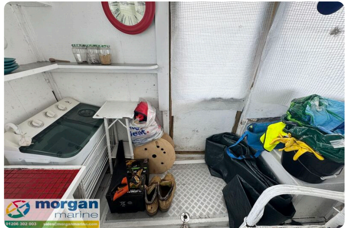
Bill O'brien Amazon MK1 Catamaran -storage