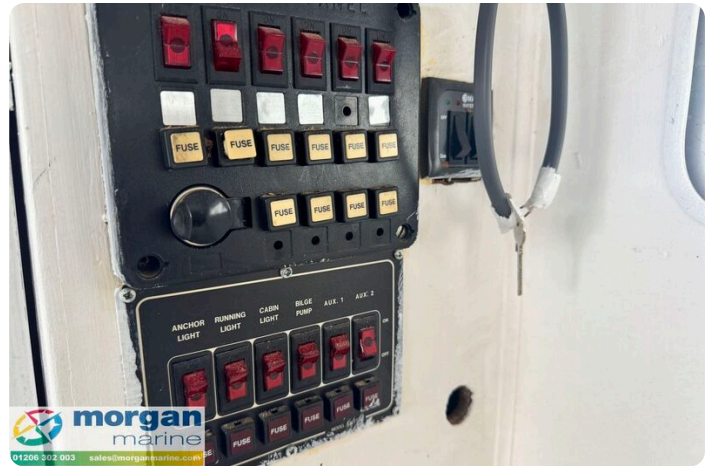
Bill O'Brien Amazon MK1 Catamaran - switch panel