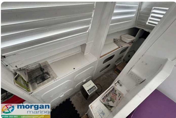
Bill O'Brien Amazon MK1 Catamaran - storage 2