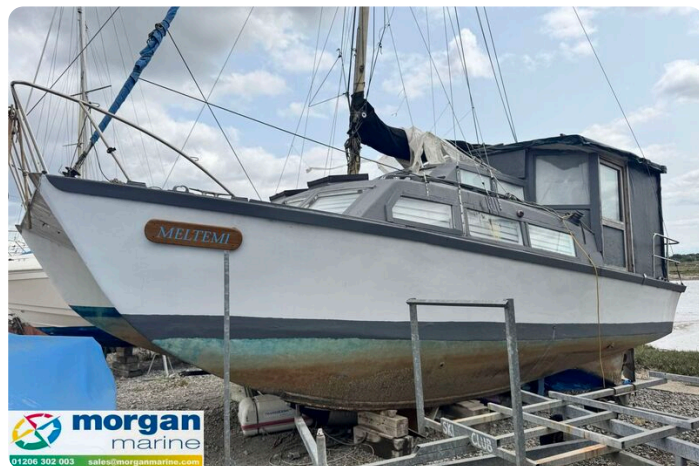
Bill O'Brien Amazon MK1 Catamaran - side view