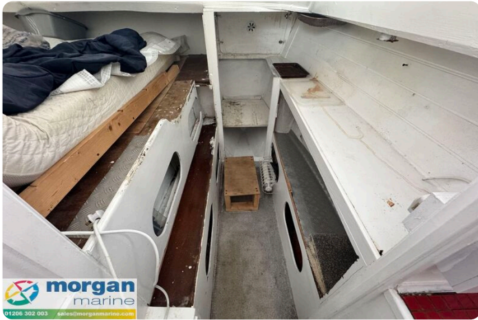
Bill O'Brien Amazon MK1 Catamaran - storage walk