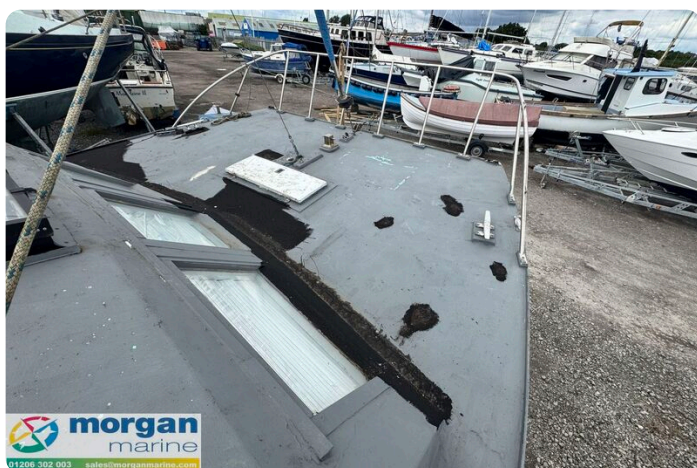
Bill O'Brien Amazon MK1 Catamaran - deck