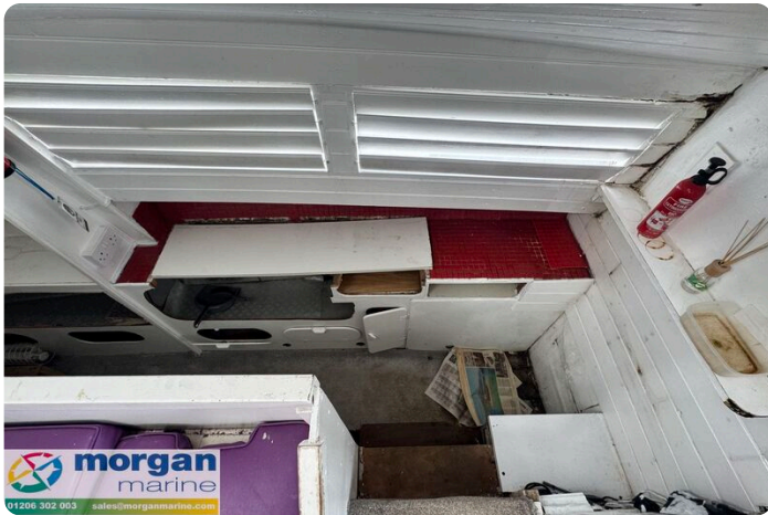
Bill O'Brien Amazon MK1 Catamaran - storage