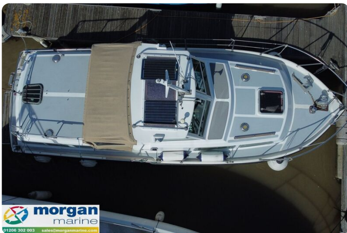
Aquastar 27 - top view