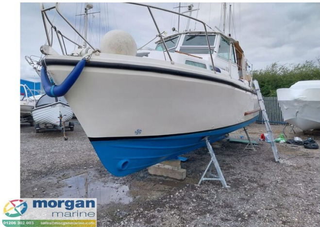
Aquastar 27 - on land