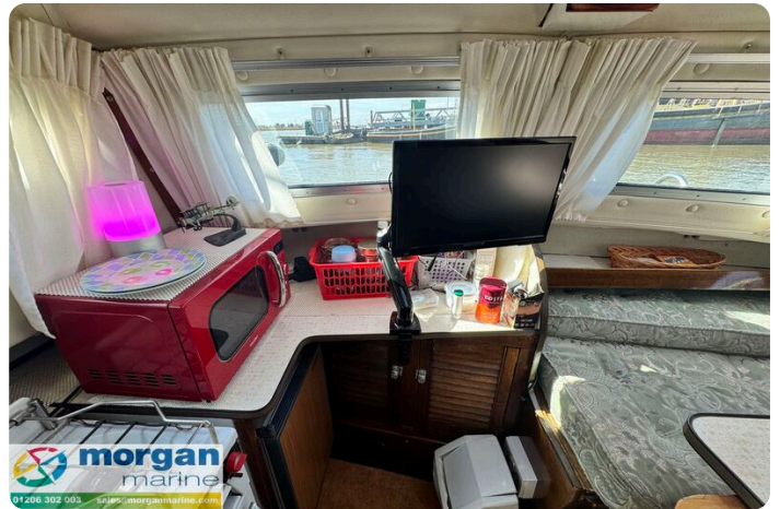
Aquastar 27 - TV