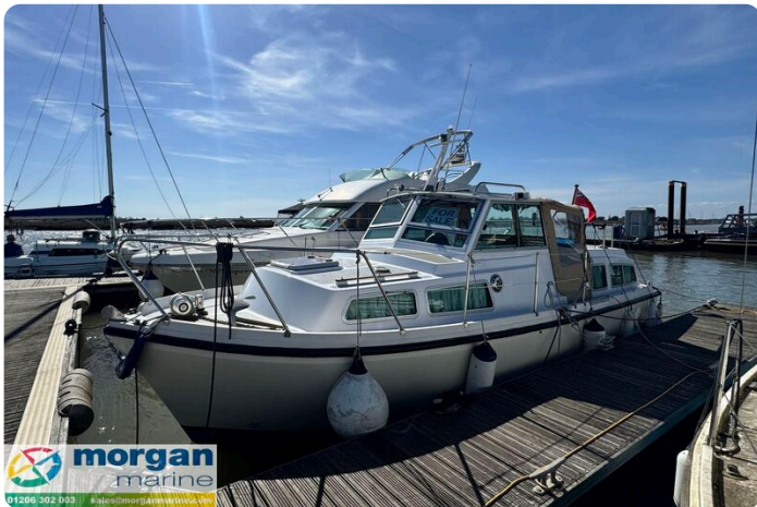
Aquastar 27 - main