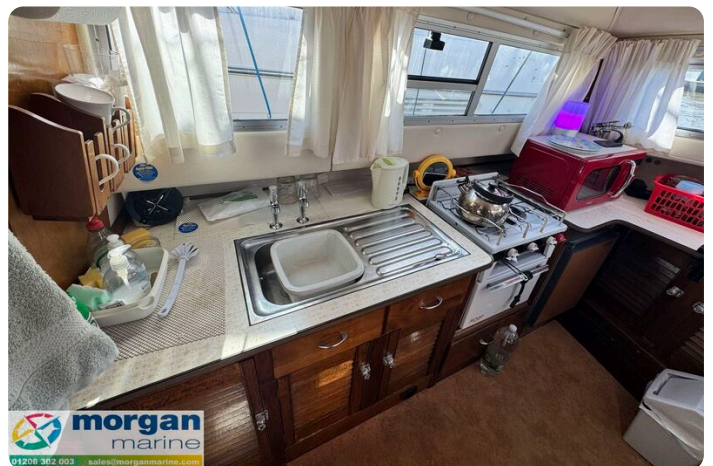
Aquastar 27 - sink