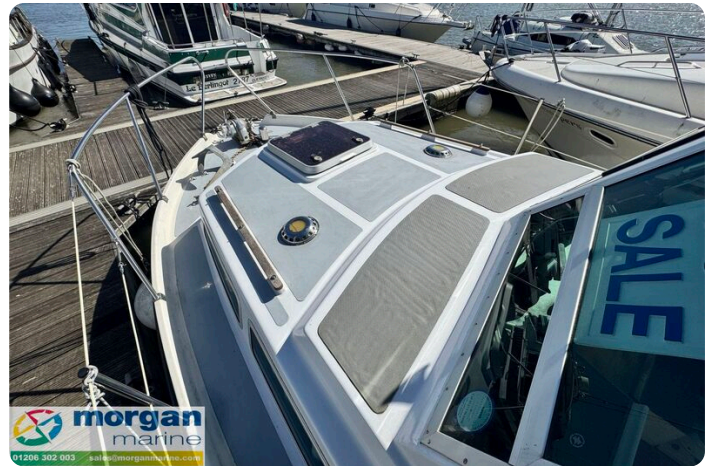
Aquastar 27 - bow