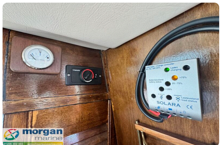
Aquastar 27 - heating