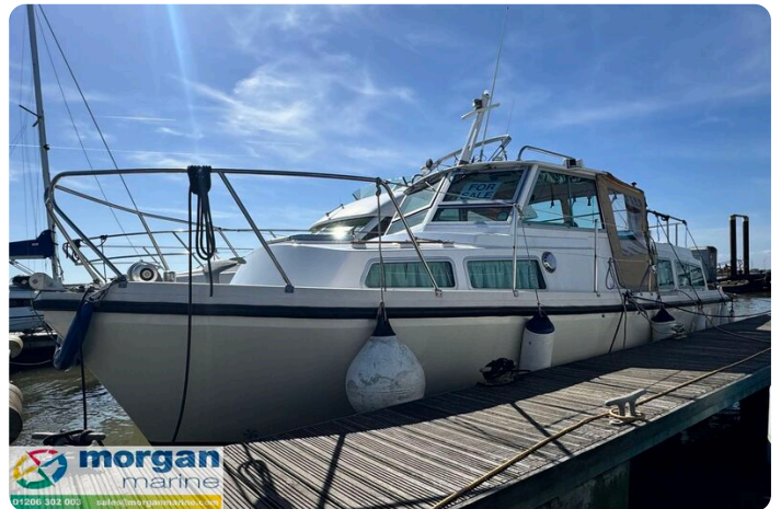
Aquastar 27 - cleats