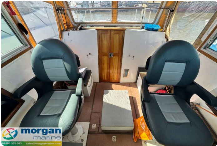
Aquastar 27 - seating