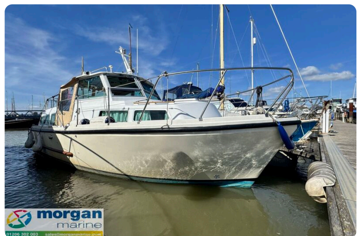
Aquastar 27 - railings