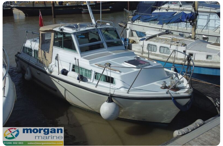
Aquastar 27 - top view