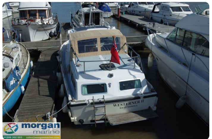
Aquastar 27 - ladder