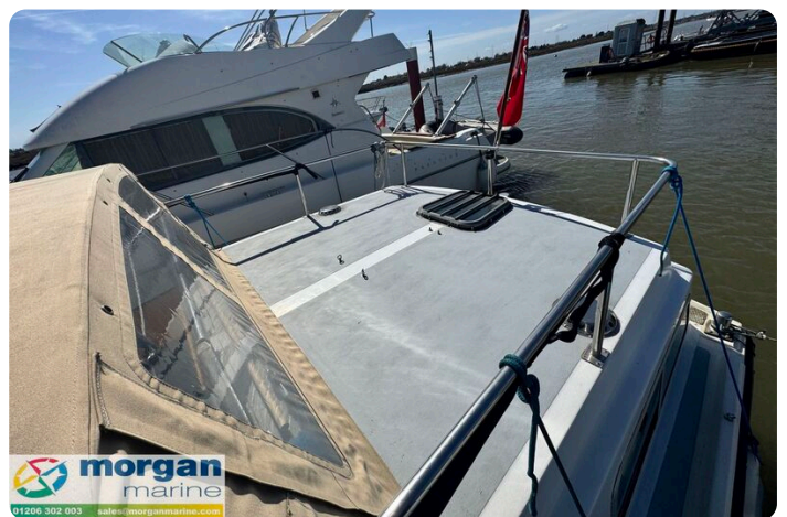
Aquastar 27 - deck