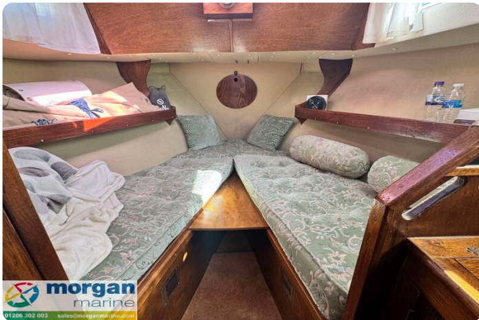
Aquastar 27 - berth