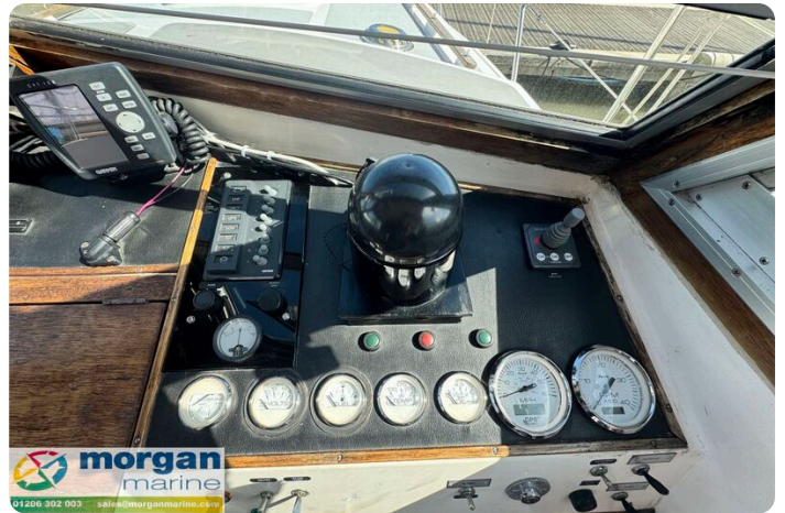
Aquastar 27 - compass