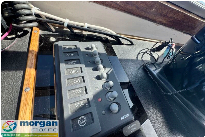
Aquastar 27 - switch panel