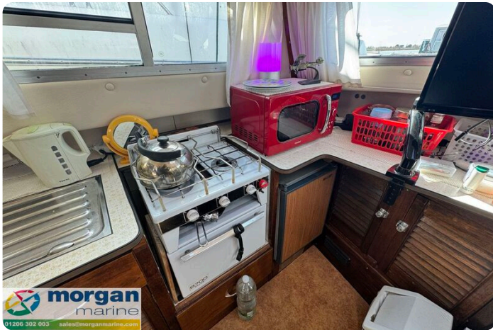
Aquastar 27 - cooker