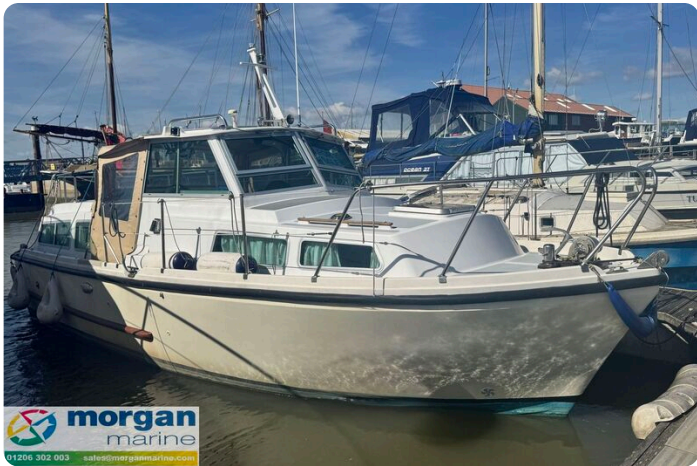
Aquastar 27 -main view