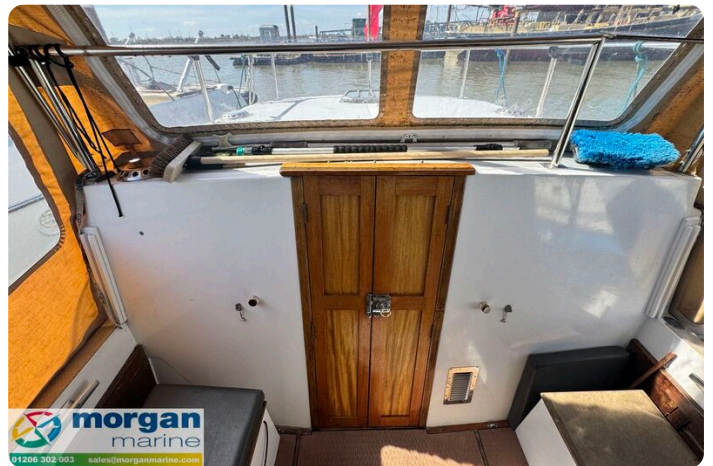
Aquastar 27 - door