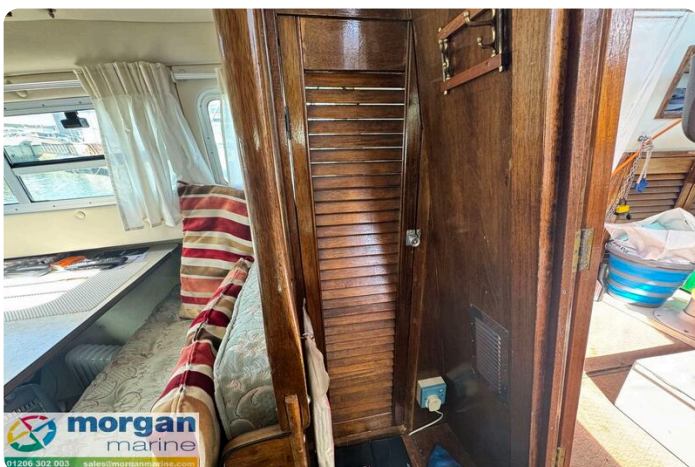
Aquastar 27 - hanging storage