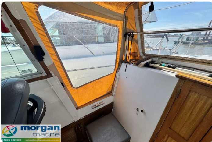
Aquastar 27 - window