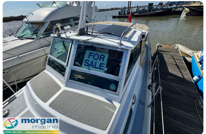
Aquastar 27 - window