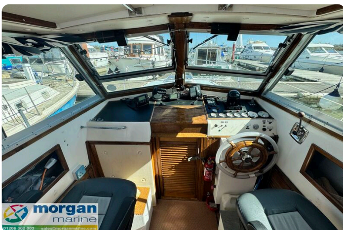
Aquastar 27 - dash