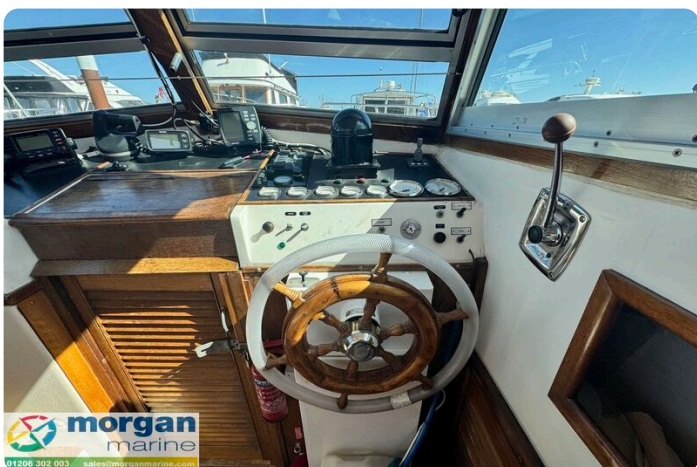
Aquastar 27 - dash