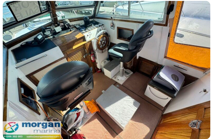
Aquastar 27 - saloon