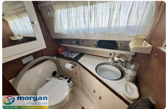
Aquastar 27 - toilet