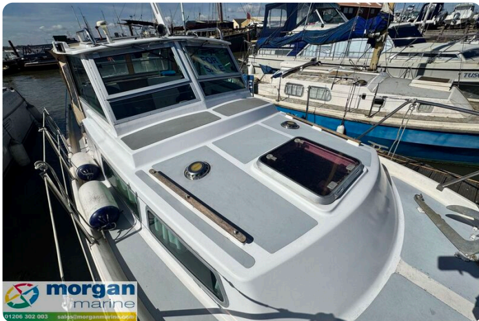
Aquastar 27 - hatch