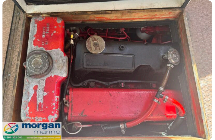
Aquastar 27 -engine