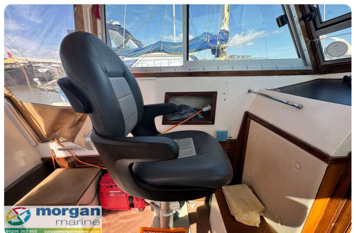
Aquastar 27 - co pilot seat