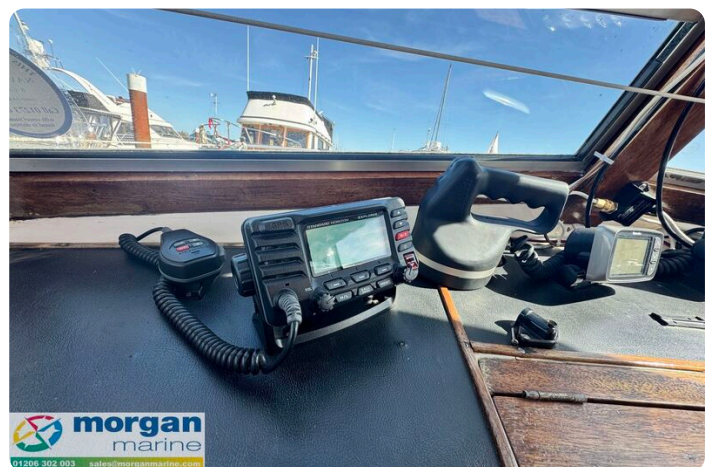
Aquastar 27 - VHF