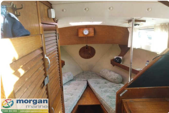
Aquastar 27 - main berth