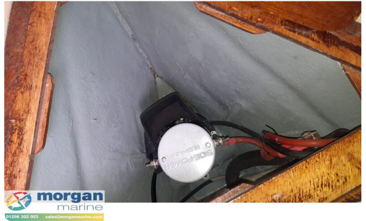
Aquastar 27 - wires