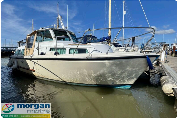
Aquastar 27 - Main