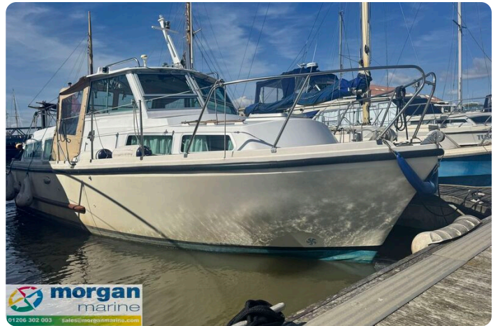
Aquastar 27 - side view