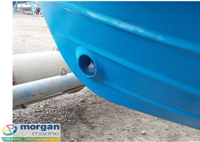
Aquastar 27 - bow thruster