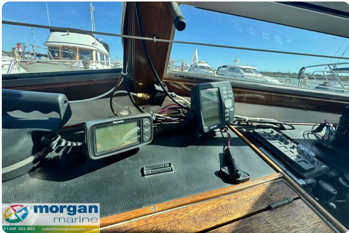
Aquastar 27 - Garmin