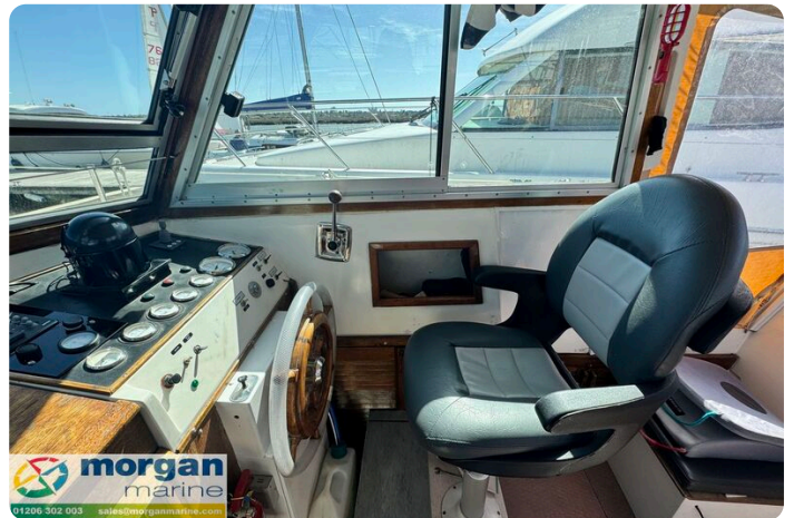
Aquastar 27 - pilot seat