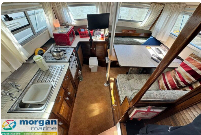
Aquastar 27 -galley