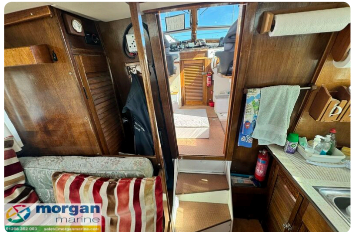
Aquastar 27 - Steps