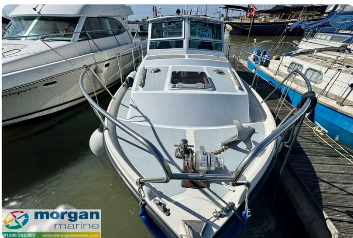
Aquastar 27 - anchor