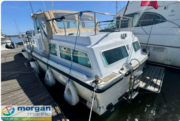
Aquastar 27 - fenders