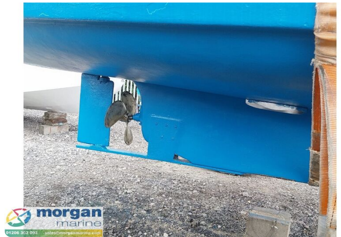
Aquastar 27 - prop