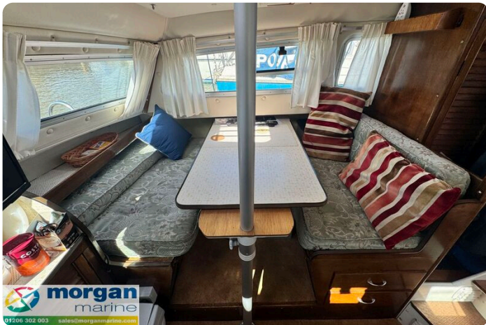
Aquastar 27 - Table